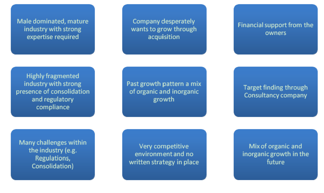
Figure 3. Main findings