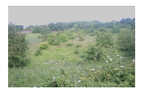
Figure 13. L5a. Site covered with vegetation

The site is a huge landmass which spans Whiston and Huyton. The park is divided into four quadrants and each differs in character and in particular, for the purpose of this research; Quadrant 4 was surveyed which is a large area of biotic nature (grassland and woodland) and consist of mudstone of carboniferous age. The outcrop belongs to the Lower Coal Measure. Sedimentary structure such as concretions was documented.