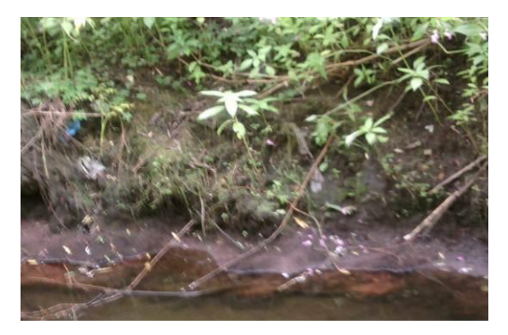
Figure 18. L6c. Section of the exposure feature showing the lithology