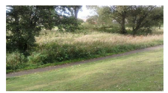
Figure 2. L1a. Brook covered by vegetation

This site is a little brook located at Kirkby which is accessible to the public. It is an open water course with lithology of sand and gravel. Exposures are of parallel bedding planes with varying lithology along the stream course. Also identified are carbonaceous materials and mud deposits, pebbles and boulders. The lithology is sandstone of Quaternary period (recent) with colour ranging from white to dark-brown. The texture of grain varies in sizes from very fine to coarse and visible mineral constituents are quartz and feldspar group. No visible structural displacement or tectonic activities are evident. Exposed features are covered by plants, trees and algae.