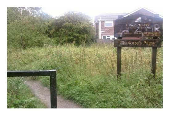
Figure 19. L6d. Accessible footpath covered by vegetation (Source: Ayeni et al., 2011).