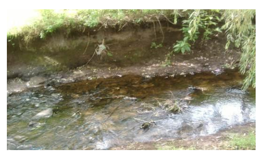
Figure 3. L1b. Observed Lithology at the South of Brook