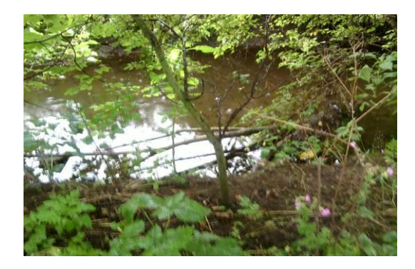
Figure 16. L6a. Section of the stream covered by shrubs and sand deposit along its bank

The location is a stream floodplain with active streamflow from East to West of the area. The geology is of sedimentary origin which has a lithology of sandstone, probably of the Carboniferous age. Steep rocks surfaces exposed on both sides of the stream along the stream channel; obscured with vegetation, plant roots and trees. The visible and accessible part of the exposure is the other side of the stream which shows the sedimentary structure of distinct parallel bedding plane while it is dark brown in colour.