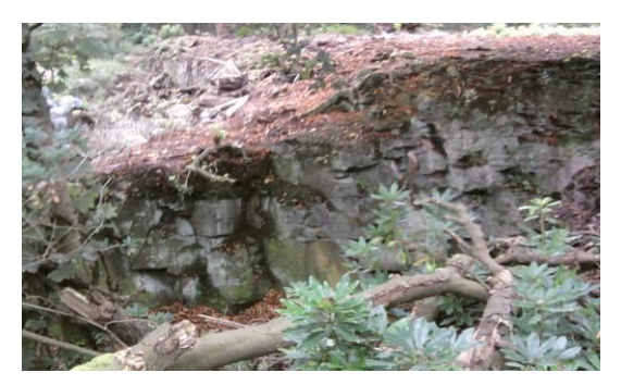
Figure 10. L4a. Rock surface showing parallel bedding covered by lichen

This site has exposures of large brownish, fine to medium grains of sandstone ridge with some mafic minerals and it is Quaternary in age. The exposure is partly covered by green lichen, tree roots and vegetation, the surface exhibits some structures; such as, faults with joints and the outcrop displays a tilting large scale of parallel bedding and natural landform is hilly.