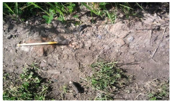
Figure 15. L5c. An area showing buried pebbles