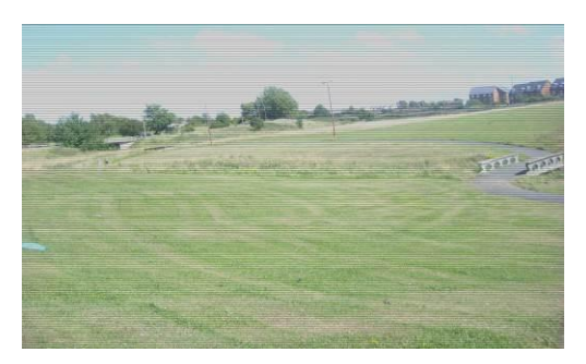
Figure 6. L2c. A general overview of the area