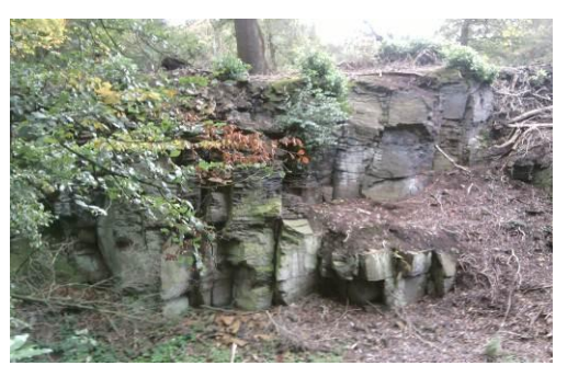
Figure 11. L4b. Exposed surface covered by dead leaves