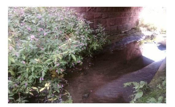
Figure 7. L3a. Section of the site showing recent sand deposition

The site is of sedimentary origin with a stream and sediment deposition along its course. The stream flows from North of the area through a Willow tree plantation to the industrial area where there is limited access. The topography presents high steep sides and covered by vegetation and weeds which obscure the whole exposure and this is an evidence of poor management. The site is composed of sand and sandstone based on the small exposure in some areas with colour ranging from brownish to dark brown. No clear texture was observed but small bedding planes were seen.