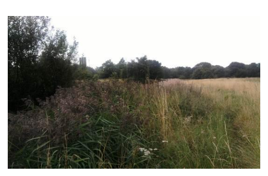
Figure 8. L3b. A long stretch of the site with overgrown vegetation