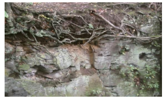
Figure 12. L4c. Weathered surface exhibiting parallel bedding and partly covered by tree roots