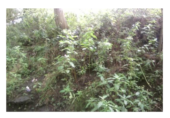
Figure 17. L6b. Stream banks covered by vegetation