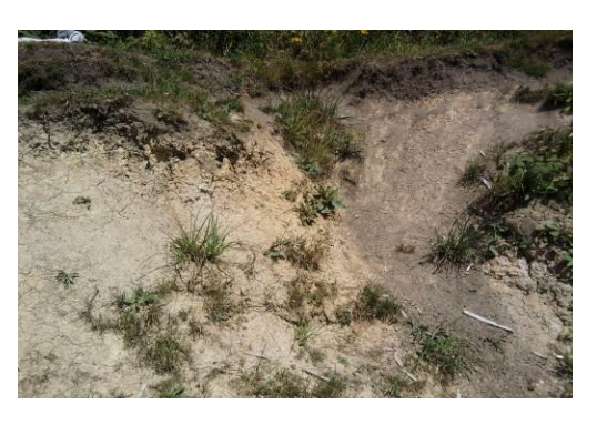
Figure 14. L5b. An area of the exposed rock (mudstone)