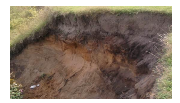
Figure 4. L1c. A massive eroded surface showing the Lithology at the South-end