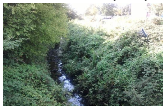
Figure 9. L3c. A section of the site that falls within a privately owned area (Source: Ayeni et al., 2011).