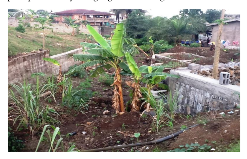
Figure 3. Valley Encroachment through Reclamation induces flooding of Chief Street Road Downstream during the Rainy Season

which is not in the best interest of the municipalities as this process leads to increased downstream flooding (Figure 3). While the data for valley or channel encroachment are enormous, it is perhaps necessary to highlight the existing situation in the two municipalities.