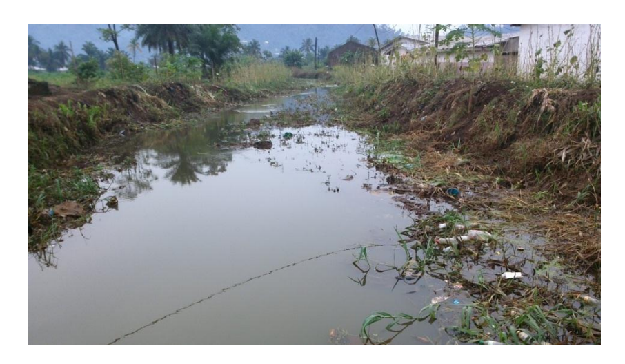
Figure 1. Flow channel of the Jengelle Stream through the Limbe New Market. The narrow and shallow channel along Manga William Street accounts for the repeated and rapid over-floods during the rainy season

Negative valley modifications include an encroachment of human infrastructures into valleys and flow channels, the blockage or river channels through house construction and the clogging of other flow channels. The increasing poor urban practices have come at a wrong time because there is increasing urbanisation which increases flood magnitudes. This incidence of increased flood magnitudes calls for much more elaborate drainage systems in order to cope with the increased volumes of water from urban floods. On the contrary, there is the absence of sufficient drainage system water holding capacity. This reduction inevitably paves the way for increased floods over time.