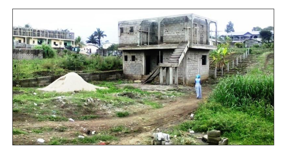
Figure 4. Buildings Construction astride the dry valley Interfluves near Blessed Hostel along Chief Street, Bomaka. The House is protected by a short concrete wall near the base to prevent an inundation of the lower portion of the house