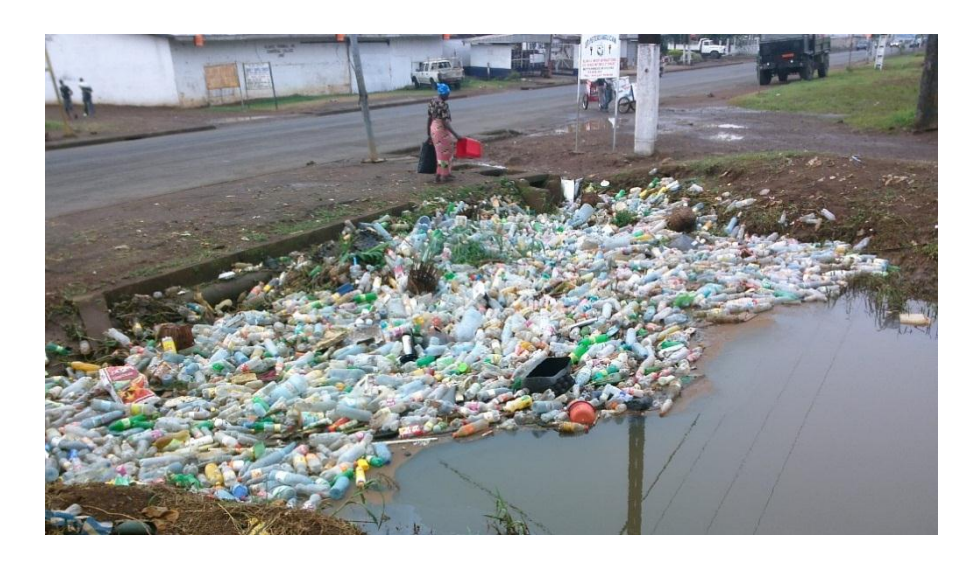
Figure 5. Urban culvert along Manga William Street, Limbe. The constricted nature of the culvert dimension stands at the origin of river blockage. Only culvert enlargement can ensure the free passage of water downstream

Small streams, brooks or rivulets in cities are most often provided with only small culverts to serve as passage ways for flood waters and bridges linking both sides of urban rivulets. Given their usual small dimensions, clogging by transported debris or other urban wastes like plastics cause floods especially when accumulated debris play a similar role like that of the woody debris. Many of our urban streams cannot flow efficiently because they are carpeted and clogged by plastic bottles, broken plastics and other non-biodegradable materials. While the issue of illegal dumping in urban streams needs to be seriously addressed, the municipalities should upgrade and expand the urban culverts into urban bridges which could allow a higher and freer degree of river flow as a result of the increased water holding capacity of the valley.