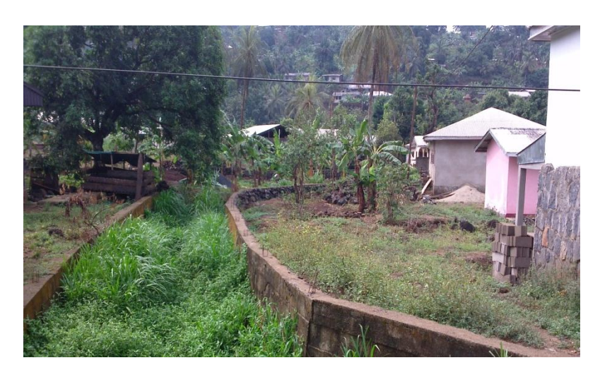
Figure 2. Human encroachment into the river valley in the Mabeta New Layout Brook (Limbe) leading to valley constriction through the illegal reclamation of flow channel.

Most dwellers in Cameroonian cities have grossly defied the urban environmental policy which stipulates that there should be no man-made structures on land across or besides the river. Within the two municipalities in question, the proximal locations of a host of infrastructures which are less than 5 metres to the stream are glaring examples of the bastardisation of the urban environmental laws. Most structures extend to the edge of the river valleys. Some encroach into the river valley (Figure 2)