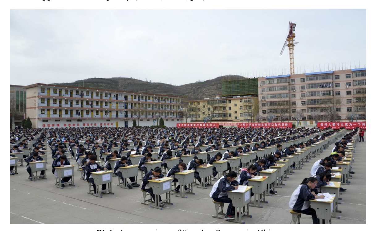
Ph4: An overview of "gaokao" exam in China

yet needs of these prerequisites to be in line with the concept of socialist harmonious society (Grenié & Belotel-Grenié, 2006) and the need to promote morality among the people. A good education was not just one that would give us knowledge and prepare us for a vocation, it was also an education that would encourage an ongoing commitment to social justice, particularly to the struggle for racial equality (hooks, 2010, p.1).