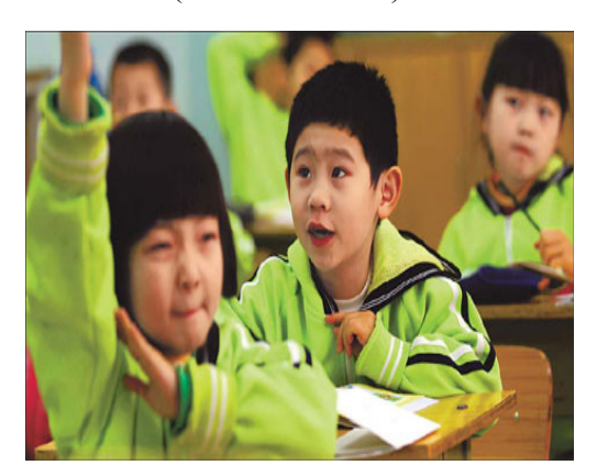
Ph5. Pre-school in urban area

urban students face an ever-widening gap in the access and quality of their respective education (see Ph5 & Ph6).