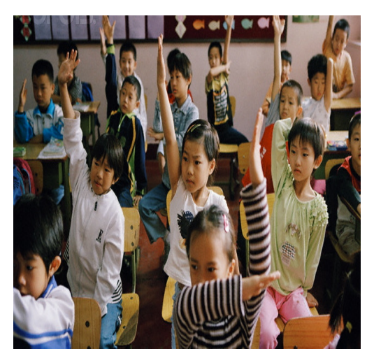
Ph1: Primary school students in Guizhou

Under China's Law on Nine-Year Compulsory Education, primary and middle school is tuition-free. However, a small tuition fee is requested from students after the compulsory nine years of education during high school. Under this circumstance it would be hard for some poor families to meet the cost of education given their weak economy, especially for parents who live in the rural area. Despite the efforts for universal education, there are still equity issues and barriers that may discourage some parents to send their kids to school. The following pictures show an overview of school attendance in city and village as well under Nine-Year Compulsory Education (see Ph1 & Ph2)