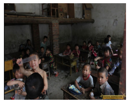
Ph6. Pre-school in rural area