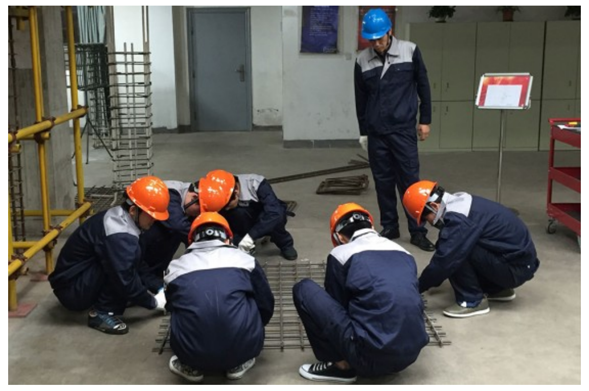
Ph3: Students at the school of the Shanghai Construction Group (Vocational School)

The development of school curriculum is one of the most important dimensions in the quality provision of basic education (Wang, 2009), this is why a system called three-level management is stated in outlines of the reforms of basic education curriculum issued by the Ministry of Education in July 2001. In this document Basic education and high secondary school each has a structured curriculum for each level of education. The main subjects in curriculum of basic education and senior high school includes math, Chinese, Foreign languages, science, physical education, comprehensive practical activities and humanities and social sciences.