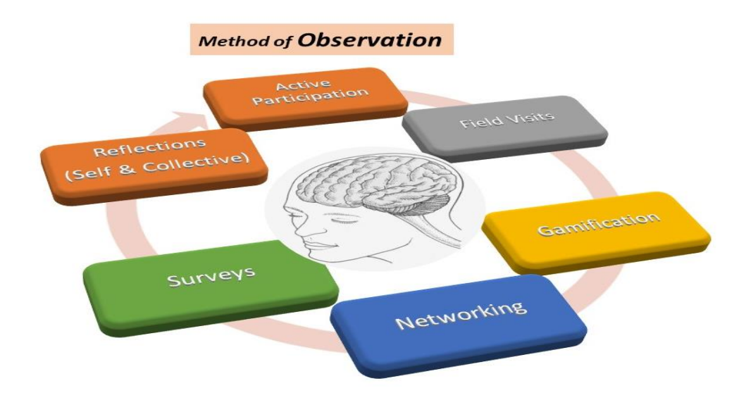
Figure 1. Illustrates the Gamification as part of the Method of Observation in Inspiration Labs

Buheji (2018) showed how inspiration labs techniques could solve any sophisticated socio-economic problems through the method of observation. Observation target to either find opportunities inside the problem or simplify the transformation by raising the capacity to realise the change in the specific community targeted. Throughout the inspiration lab, active participation, field visits, gamification, networking, surveys, individual and collective reflections are used to enhance the efficacy of observation, as Figure (1) shows.