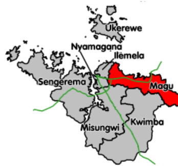
Figure 1. Mwanza regional map

The study was conducted in Mwanza, one of Tanzania's 31 administrative regions. The national census of 2012 said the region had a total population of 3,125, 995 (THDR, 2017) with eight district councils, namely: Magu, Ukerewe, Buchosa, Sengerema, Kwimba, Misungwi, Ilemela and Nyamagana (URT, 2017). Region 8 cannot be seen in the map properly. The regional capital Mwanza lies in the northern part of the country, located between latitude 1° 30' and 3° south of the Equator. Longitudinally the region is located between 31° 45' and 34° 10' east of Greenwich. The region shares borders with Lake Victoria (Figure 1) in the North, Kagera and Geita in the West, Mara Region in the East, while Shinyanga and Simiyu regions are located on the South and South-eastern side of the region.