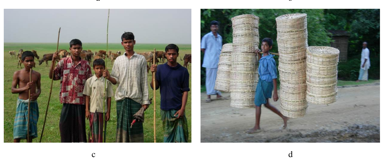
Figure 3. a. Coastal boys and girls engaged in fish segregation (species wise), b. A young boy gathering shrimp fry in the coast, c. Floodplain boys engaged in cow ranching, d. A floodplain boy goes to local market to sell fish baskets