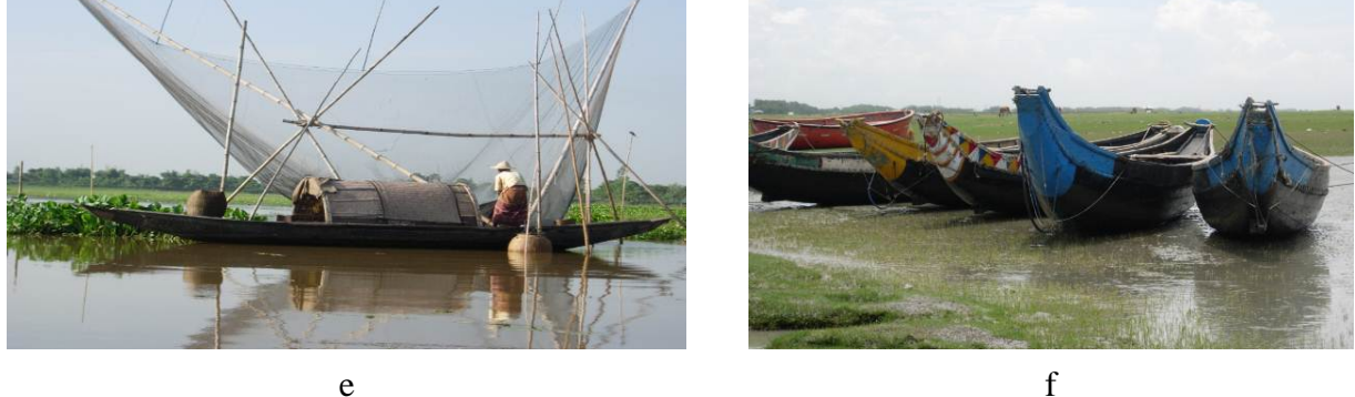
Figure 2. a. Snapshot of the Hakaluki haor fishing village in the wet season, b. Farmers seen ploughing in the Hakaluki haor basin, c. A view of coastal farming village before harvest of paddy, d. Children seen playing in coastal fishing village, e. Lift net in operation in floodplain areas, f. Typical inshore coastal fishing craft usually featuring the caste-based fishers.

The unit of analysis in this research spanned from individual to households to community. Direct observations and participation with the fishers on the fishing craft were the most useful and straightforward way to learn about their experience and mental map. In similar vein, for learning from the farmers, we set out FGDs and interviews directly in the fields, predominantly rice fields in both the coastal and floodplain farming villages, and also betel leaf gardens in the case of coastal farming village.