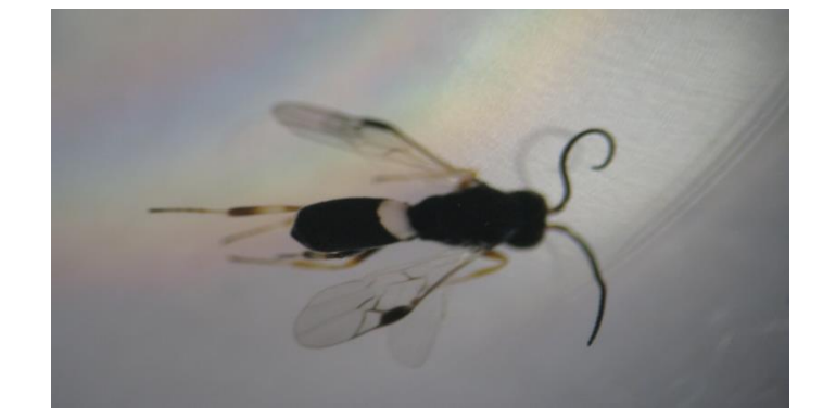
Figure 2. Chelonus blackburni isolated from olive fruit samples.

2165 flies and 333 parasitoids were emerged from the 23096 collected olive fruits(Table4). The parasitism rate highly varied across all locations and ranged from 2.4% ( Ammatour) to 42 %(Baanoub)(Table4).