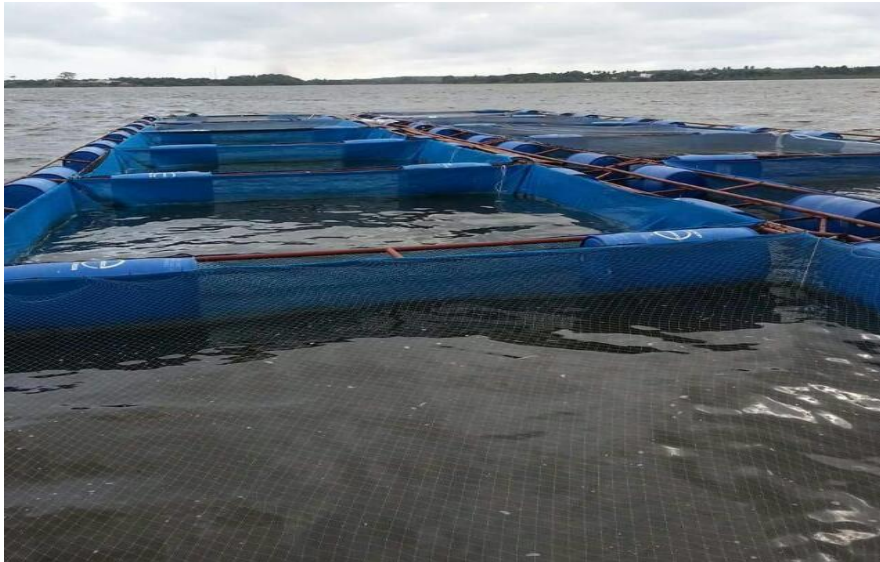
Figure 1. O. niloticus breeding device: floating cages in Toho Lake of Benin

The measurable morphometric characters of the fish as described by Stiasny et al. (2007), recorded at the beginning and the end of the trial were as follows: Total Body Length (TL), Standard Length (SL), Predorsal Length (PL), Head Length (HL), Dorsal Fin Base Length (DFBL), Interorbital Width (IOW), Body Height (BH) and Caudal Peduncle Height (CPH) (Figure 2). The Body Weight (BW) was also recorded during the trial. Weight was measured with a digital electronic scale (SH & A: SHS: SUPER HYBRID SENSOR; max range: 2200 g; accuracy: 0.01 g) for small and medium sized fish and another digital electronic scale (UWE; max capacity: 30 kg; accuracy: 5 g) to weigh large specimens. The morphometric parameters of the fish were measured using an ichthyometer (Total length: 1m; graduated in cm) for the large fish, and a Vernier caliper (graduated in cm) used for small specimens. To determine the growth response of the experimental fish, several parameters were calculated (Table 3): Final Mean Body Weight (FMBW, g), Average Daily Weight Gain (ADWG, g), Specific Growth Rate (SGR, %/day), Feed Conversion Ratio (FCR) and Protein Efficiency Ratio (PER). The Survival Rate (%) of the fish was also evaluated at the end of the experiment.