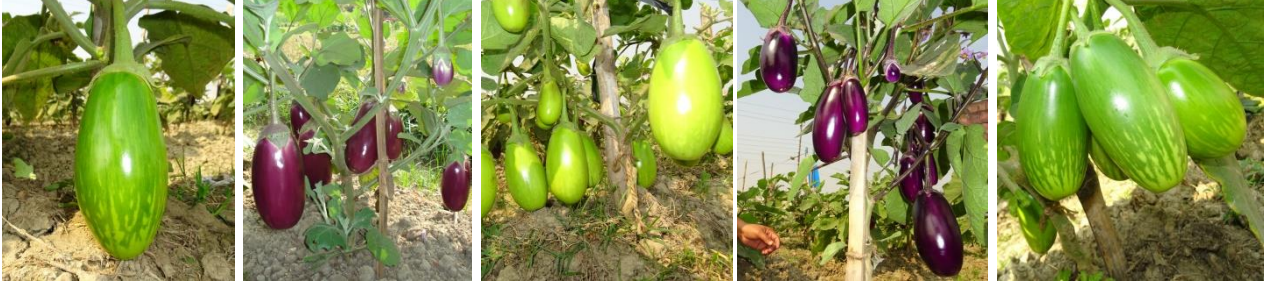
SM275BARI Hybrid Begun-2BARI Hybrid Begun-4Hybrid 5x216Hybrid 21x11Figure 1. Morphological differences among eggplant cultivars in Bangladesh