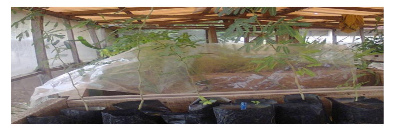
Figure 4. A. sieberiana growing in screen house.