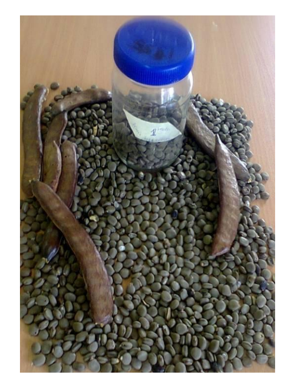
Figure 2. Acacia sieberiana pod and seeds.

Figure 1. Acacia sieberiana tree