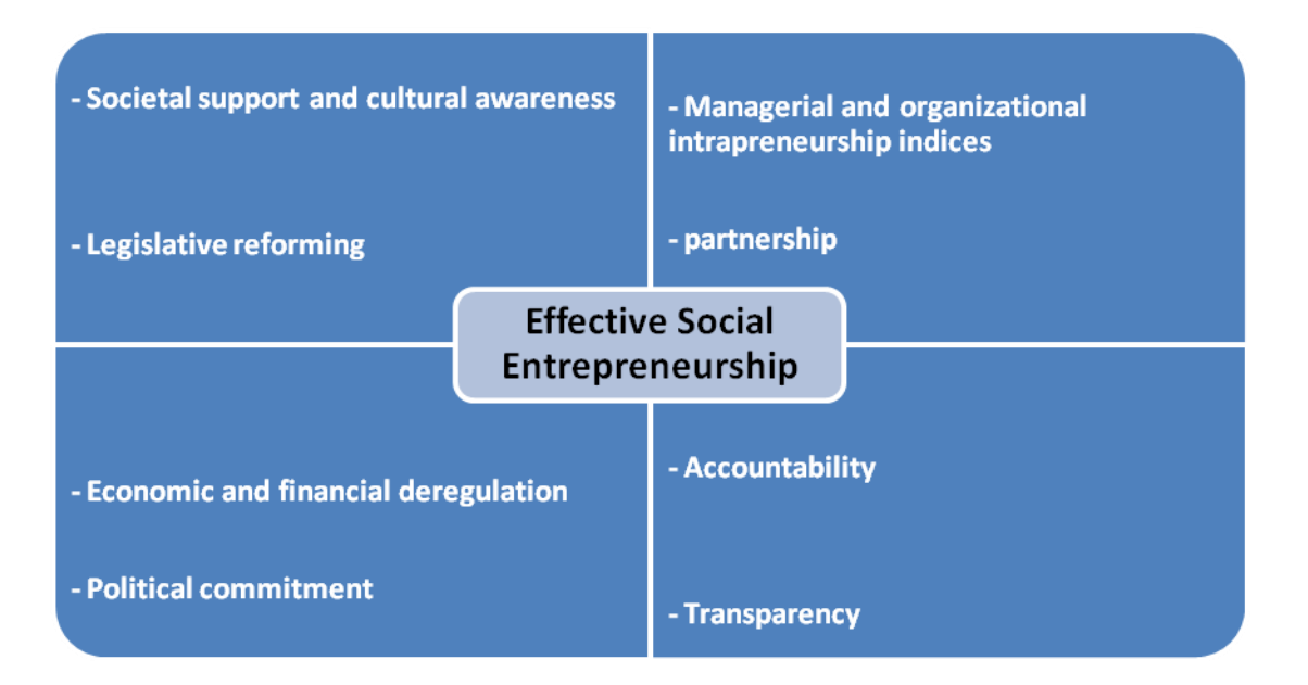
Fig. 2: Proposed remedy indices to confront the Egyptian waqf corporate problems

- Managerial leaders' commitment and support to use intrapreneurship standards to create an effective social entrepreneurship corporate; will facilitate the execution of organizational intrapreneurship policies and procedures; and likewise will decrease the staff' resistance. Then, support from higher-level managers can have many forms as promoting behavior, work discretion (the freedom to decide how to carry workout), rewards/reinforcement systems, resource availability, and management systems.