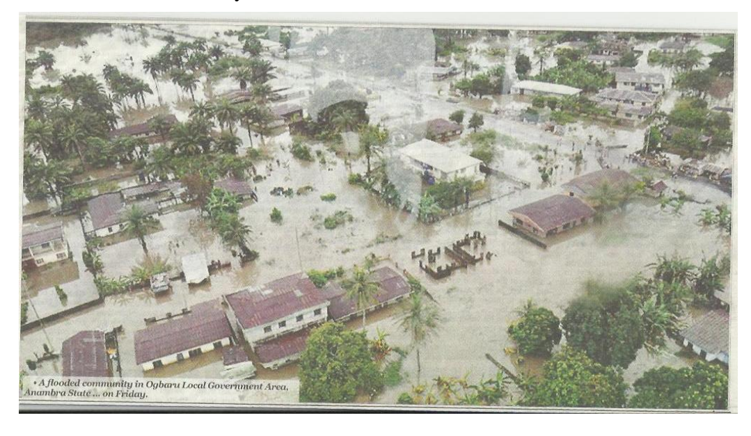
A flooded community in Ogabru Local Government Area, Anambra State

The UN bombing perpetrated by Boko Haram sects is another dislocation of people from their work places and even at homes. The suicide bomb attack on the united nation's building in Nigeria's capital, Abuja, on Friday morning, 26<sup>th</sup> August, 2011 left 18 people dead and