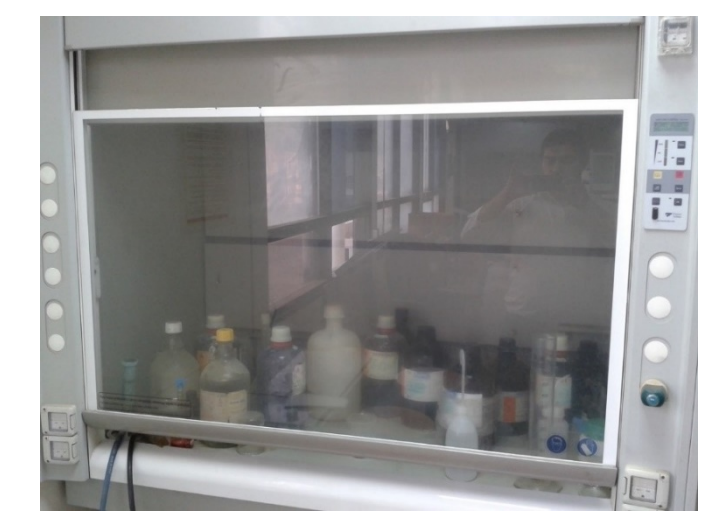
Figure 4. Improper use of fume hood (chemical handling accessories) by laboratory staff

Chemical storage is a part of laboratory chemical management which demands the involvement of all academic key players. From purchasing of chemicals, handling, labeling, and storage up to disposal need a professional approach to minimize their potential risks. A good inventory assists in proper maintenance of chemical safety of a laboratory. It also allows efficient use of resources as it helps in tracking of resources that is, what is the chemical use for, how it use and what goes to waste. Because an inventory identifies quantities and physical locations of chemicals, it can be used as a reference to guide purchases and ensure that only needed supplies purchased. It reduces stockpiling of additional materials and minimizes the costs and management of waste. Further, with an inventory, it becomes possible to organize chemicals by properties. Foster (2004) Highlighted in his article that Improper chemical storage can enhance the severity of laboratory incident like incompatible chemicals can mix and create a fire hazard, toxic fumes, and explosions in case of a chemical spill or fire in the laboratory premises. So, it is mandatory to store chemical according to their hazard category and compatibility by following own MSDS. It is important to educate the laboratory workers about the proper chemical storage practices (Foster, 2004).