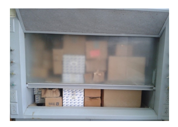
Figure 2. Severely managed Fume hood with extensive storage

The second factor, maintenance of fume hood contains two items and account for 11.06% of the total variance. This factor deals with the importance of university's inspection of fume hoods to ensure the safety in chemical laboratories. The blockage of exhaust slots by containers and equipment can affect the airflow as figure 2 shows a severely managed fume hood by laboratory staff which displays a lack of inspection at any level. Maintenance of fume hood in the chemical laboratories can be ensured through the implementation of university inspection plan at the departmental level. The slots and baffles at the back of the hood should be unobstructed as standard practices.