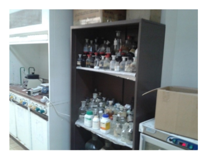
Figure 3. Bad chemical management in a chemical laboratory

The third factor, proper chemical storage, had three safety items and accounted for 10.48% of the total variance. Proper chemical storage in the chemical laboratories can minimize the incompatibilities and occupational exposure to chemicals as figure 3 shows severe chemical management in a research laboratory of the surveyed university. Balkhiour (2011) found a lack of chemical storage strategy coupled with bad ventilation scenario in the selected university laboratories. Mogopodi et al. (2015) found incompatible chemical storage in a junior secondary school laboratories.