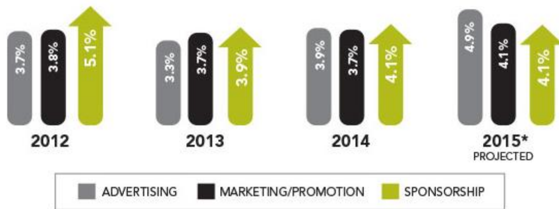
Figure 3. The annual growth rate of expenditures on sports sponsorship, advertising and sales promotion [2012 to 2015].

Source : http://www.sponsorship.com/iegsr/2015/01/06/New-Year-To-Be-One-Of-Growth-And-Challenges-for-Sp.aspx