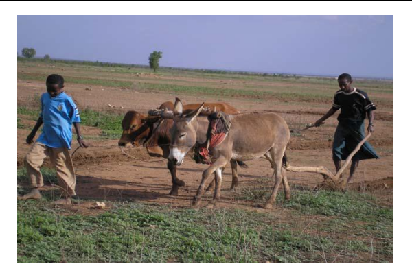
Plate 6. Ploughing with different animals

Adaptation of mobile phones: The use of mobile phones has been widespread among the pastoral community. The traditional early warning information and situation analysis of the neighboring areas prior to mobility including on pasture, water and prevailing of disease are shared to the community with the help of mobile phones. Similarly the mobile phone facilitates livestock market information at different market centers domestically or cross border with merchants and pastoralists. Therefore, the mobile technology ensures safe mobility and access to market information as destocking and restocking strategy on the good and bad seasons (plate 7).