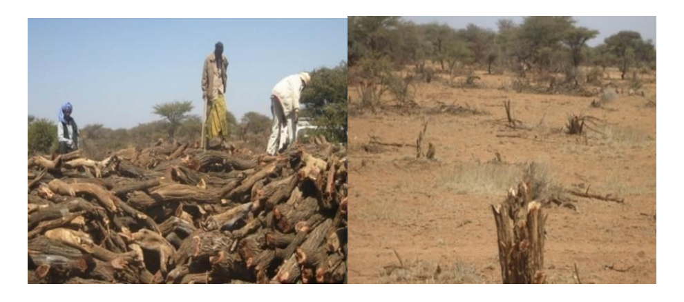
Plate 1. Deforestation due to commercialization of charcoal

Livelihood engagement: Usually the poor and the middle income Agro-pastoralists are engaged on charcoal making and some are organized in a self-help group (pate 1). These charcoal makers have to travel long distance due to the continuous deforestation and conflict with the local pastoral community who are losing their rangelands due to deforestation and land degradation. Generally the deforestation compounded with the prolonged drought brought both the pastoralist and agro-pastoralists in the vicious circle of poverty.