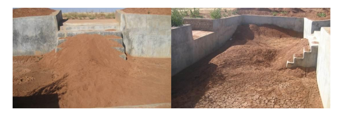
Plate 2. Siltation of Haffir dam in Lankerta

In appropriate technology: The construction of water harvesting technologies like the Haffirdam by the NGOs and government has played fundamental role in watering the livestock and for human conceptions. Usually the design of the dam is seventy meters in width and hundred meters in length and three meters in depth. It has also a silt trap as a package. However, in some localities the Haffir dames are constructed as emergency intervention prior to upstream treatment with enclosure and afforestion, hence the Haffir dame is silited up in one year as shown in plate 2. This has at least two implications; first the pastoralists become more vulnerable due to the defective technology and forced to travel long distance and cover water expenses. Secondly they lose trust on the government and NGOs who brought defective technology.