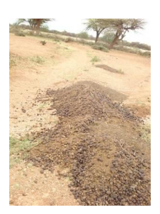
Plate 5. Manure on the diversion ditches to be diluted during rainy season

Diluting of manure: As a component of intensification of pasture and crop production some of the agro-pastoralists are using diversion ditches to harvest water from roads. Manure is accumulated on the different spots of the diversion ditches to be dissolved and transported to the pasture and crop land during the rainy season (plate 5). This innovative practice is not only improve the fertility of the soil and increase the land productivity and decrease also the labour demand to transport manure to the plots. Therefore, a fertile soil with water harvesting practice is in a better position to develop resilience to climate change.