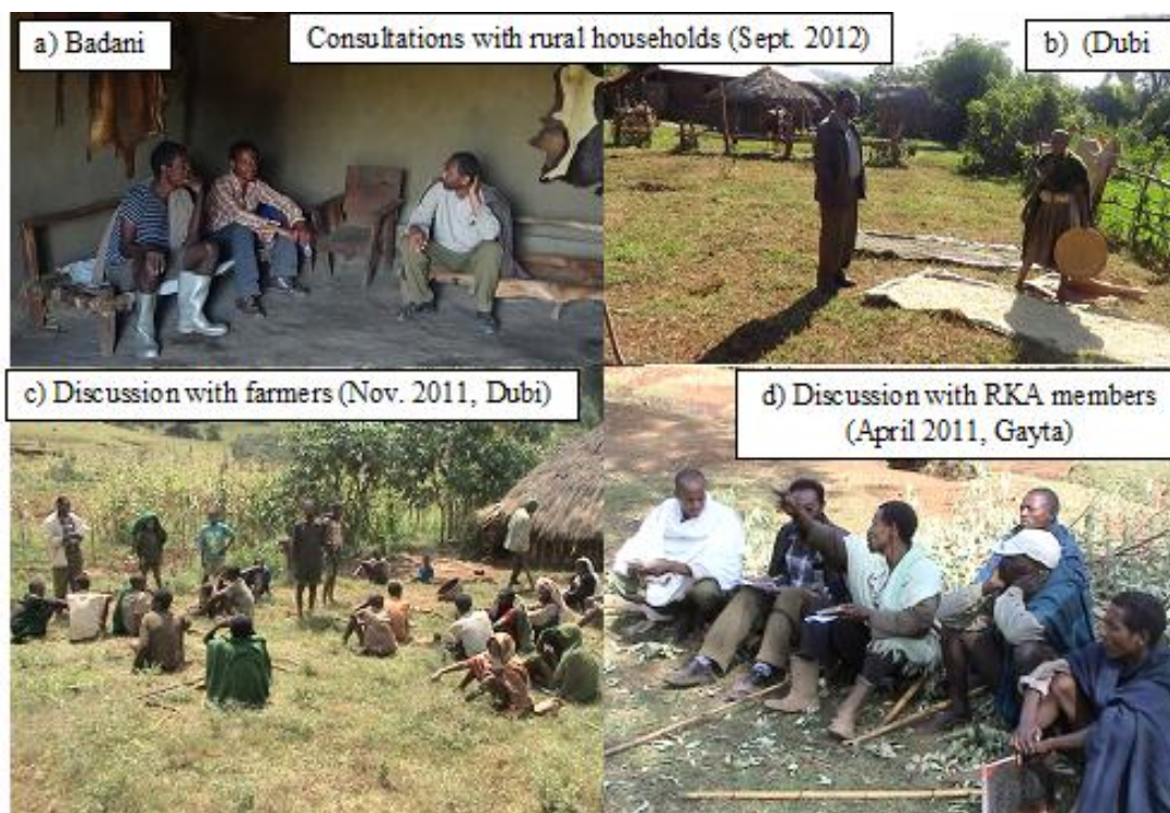
Figure 2. Discussions with different farmers and farmers' groups

more problems arise during their implementation. They also improve and strengthen the social relationship between client farmers. The finding has support from the works of Lapa & Pandey (1999) in the Philippines, Mbaga-Semgalawe & Folmer (2000) in Kenya and Mosseye & Belay (2018) in Ethiopia. During data gathering activities, it was checked that farmers were working in groups on their farmlands (see Belay & Bewket, 2013a, 2015; Belay et al. , 2017). However, during FGDs and key informant interviews (Figure 2), farmers were complaining that their indigenous labour-sharing experience is disrupting by the recently introduced politically enforced ‘one-into-five’ 2 farmer arrangement. This conforms to the recent claim reported in Mosseye & Belay (2018) in East Godjam, Ethiopia. Hence, care has to be taken not to disrupt the inbuilt labour-sharing associations of the farmers in the study villages and everywhere in Ethiopia.