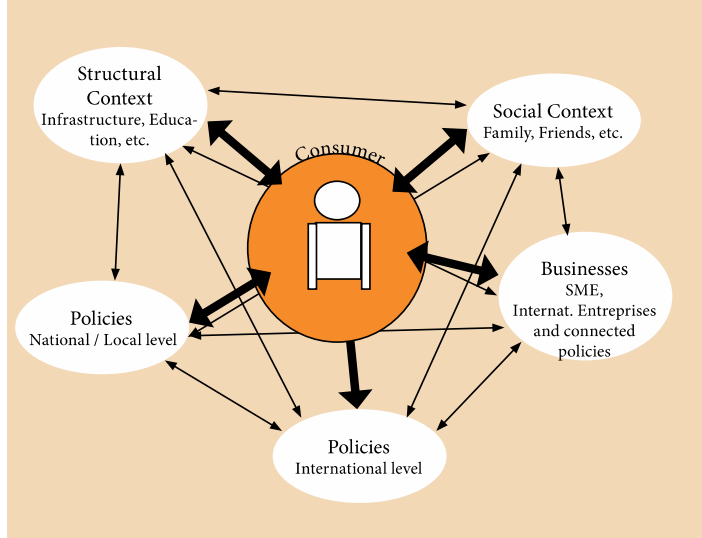
Figure 2: Consumer Interdependencies of a Multi-Level Actor Network (own depiction)

Seeing the consumer, we have to consider several strong interdependencies (see Figure 2, simplified version – extended version see Liedtke et al. 2016, Liedtke et al. 2015c,d).