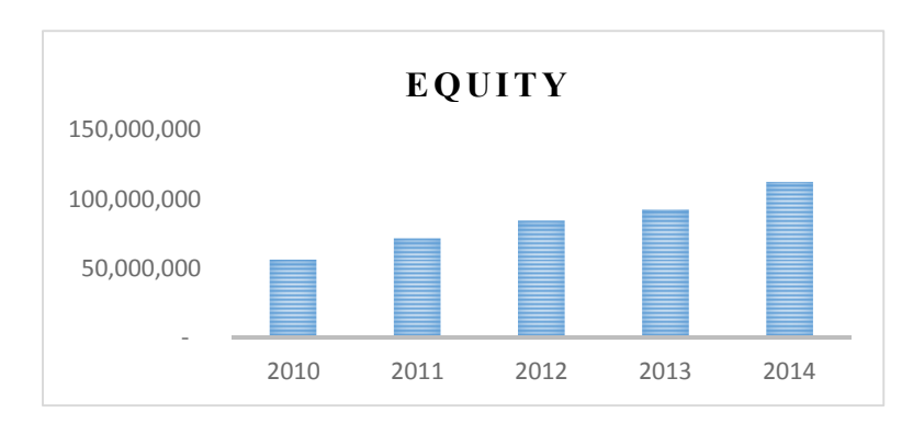
Figure 1. Equity value in the insurance industry

The prospect of the insurance industry can also be seen from the value of equity that continues to increase every year in this industry. In the OJK report, the equity value of this sector experienced a rate of increase. This will bring a positive trend for the domestic insurance industry to prepare for the ASEAN Economic Community (MEA) event where the insurance industry sector will be strengthened.