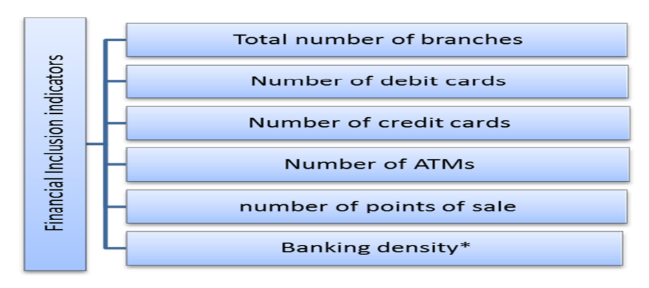
Figure 1. financial inclusion indicators

Data about access and usage was obtained from the reports published by the Central Bank of Egypt (CBE) which aggregates the financial soundness indicators of the Egyptian banking sector in the period from 2012 till September 2018. The indicators that were used to assess financial inclusion in Egypt are presented in the next figure: