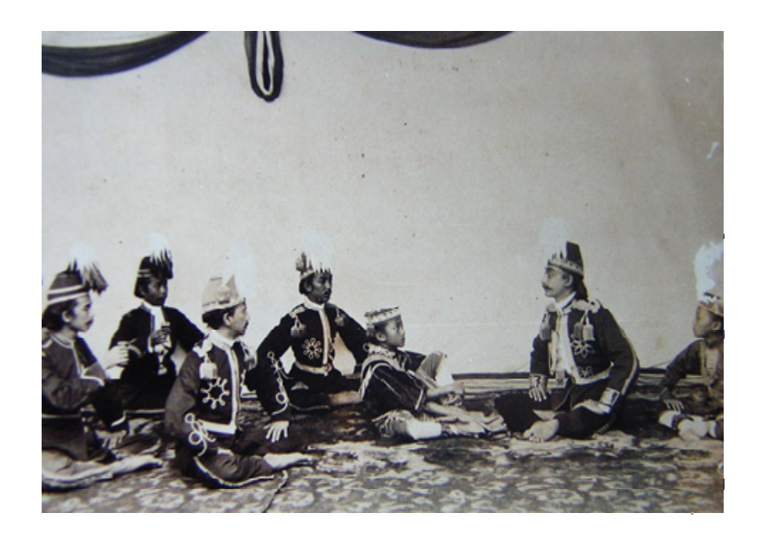
Figure 4. Sitting on the right is Wiroguno who acts as Adipati Sindhura at the Langendriya performance in 1907 (Photo Collections of K.R.T. Wiroguno Center for the Study of Archives and Art Documents, Yogyakarta, 1907).