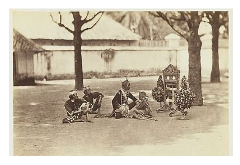
Figure 2. Damarwulan the main role of Langendriya , Yogyakarta style 1885

be explained as follows. Opera in a Western perspective is one of the musical drama genres which presents a play with dialogue using songs and accompanied by a complete orchestra (Sommerset-Ward; 1998: 79--81). This term is clearly not one hundred percent correct if its use in the Langendriya context refers to the term opera from a Western perspective. However, at least it can be referred to from the use of dialogue elements that use singing, this can be paralleled in the sense of opera drama. If in the development of Western opera, the ballet opera genre appears, then this may be closer to the term Javanese opera drama in the Langendriya genre. In this sense, the Langendriya opera drama is a play in which the conversations are sung and the movements of the performers are danced. According to Sularto, Langendriya is the first genre form of Javanese dance opera in the treasury of traditional Javanese theater (Sularto: 1987; 44--45). This assumption clearly does not have a reliable reference from the perspective used. As the perspective of opera art from the Western view clearly cannot be matched with Langendriya, however, if it refers to opera ballet art, then it is still quite close to the element of presenting the dialogue being sung. One thing that shows the similarity in the form of aesthetic reality is that the two typologies of opera, both from the Western and Eastern perspectives, are both an elite performance art.