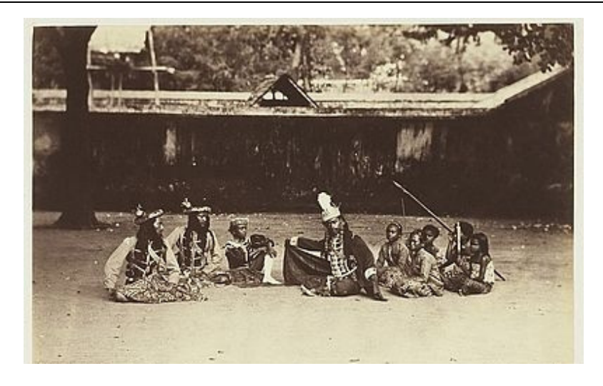
Figure 3. The scene Menak Jingga nglana an antagonist role of Langendriya Yogyakarta style, 1895