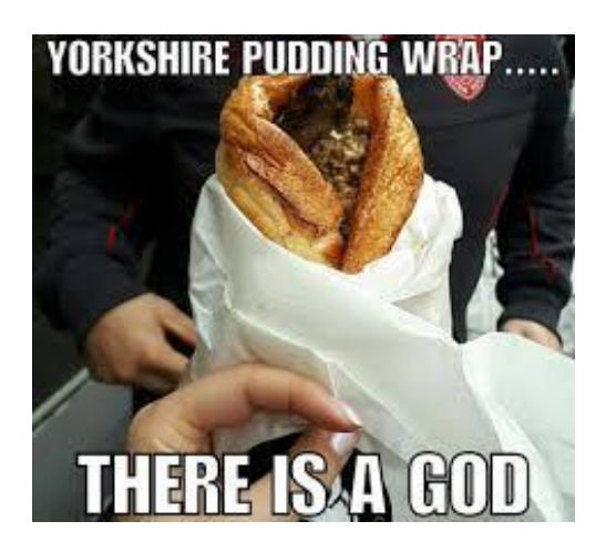
Figure 3. Yorkshire pudding wrap

This evolution, however, finds its apotheosis in the meme reproduced in Figure 3. From a visual perspective, this meme, in reality, sets itself in opposition to the first two, in that it does not depict any authority or important character. On the contrary, it appears evident that the actants in this meme can be identified as the people in the street, who do not partake in the status that characterizes, albeit in very different ways, the participants of the first two memes. Yet, from a linguistic perspective, the appreciation of the traditional pudding appears here highly intensified. Thus, from the secular world represented by Queen Elizabeth, via the epic world of Boromir from Tolkien's novel, the traditional dish finally reaches a mystic level in the third image, which explicitly mentions God, with all the consequences this entails. Indeed, the third meme, despite its "ordinariness", implicitly testifies to the "heavenly" and "divine" nature of Yorkshire pudding.