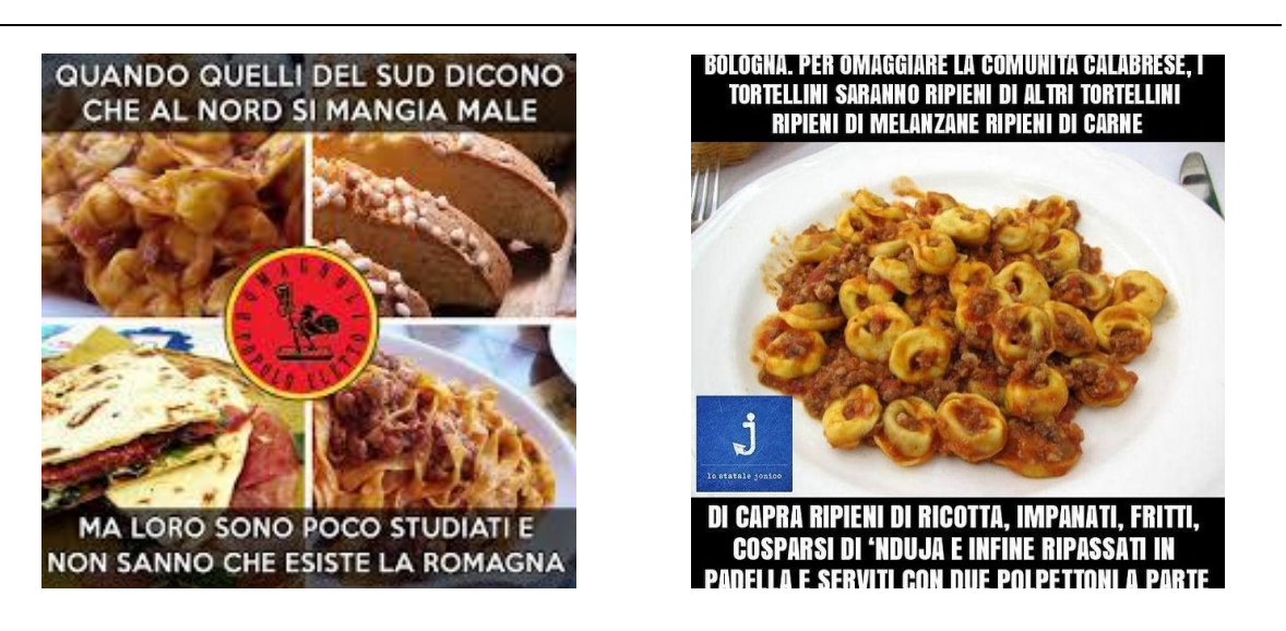
Figure 10. North vs South

Naturally, if British cuisine is characterized by various dishes, it is undeniable that, in Italy, each region is renowned for its peculiar specialties: canederli from Trentino, polenta from Valle d'Aosta, trofie with pesto from Liguria, carbonara pasta from Lazio, cassata or arancini from Sicily, etc. (Note 2). Within this scenario, Emilia Romagna stands out for its richness in terms of culinary tradition, and within the same region, each area/town/village has its own typical dish or a variant of the same dish. Clearly, being Italy a country where the notion of campanilismo is still very much present, it is often possible to witness actual (if benevolent) fights between different regions and/or towns, aiming at determining which one can claim the most delicious dishes.