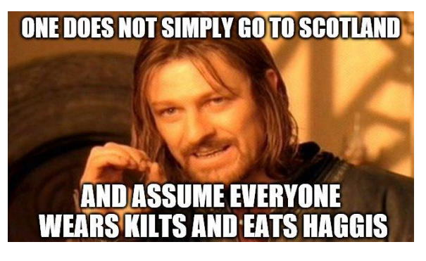
Figure 6. Sean bean and scottish cuisine