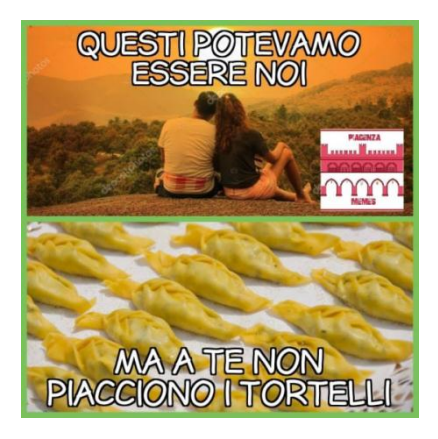
Figure 17. No tortelli no relationship

As figure 17 testifies, given the opportunity to have a relationship with a beautiful girl, the male character represented here refuses to go out with her, on the ground that she does not like one of the most traditional dishes from Piacenza, namely tortelli (Note 4). The verbal text actually reads: "This could have been us, but you don't like tortelli ". Thus, verbal language, together with the visual, which portrays the typical fresh pasta in the foreground, construe the identity of the male character as a "true" person from Piacenza, who puts his culinary tradition above everything else.