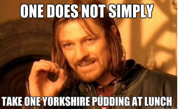
Figure 1. The queen and Yorkshire pudding

Figure 2. Sean bean and Yorkshire pudding