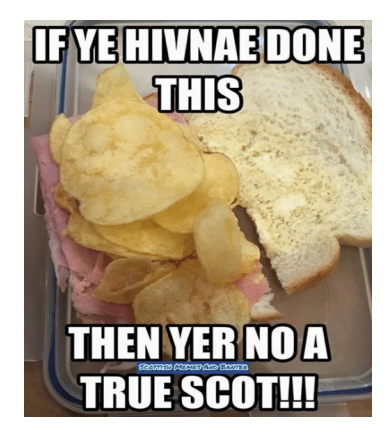
Figure 7. True "Scottishness"

Yet, as the meme above suggests, food can and does become a marker of invisible culture as well. First of all, it is significant that, despite Bean's verbal message in Figure 6, in the majority of the memes retrieved for this study (including all those which, for reasons of space, could not be included in this paper), almost no indication of traditional cookery is suggested, other than the "savoury pudding containing sheep's pluck, minced with onion, oatmeal, suet, spices, and salt, mixed with stock, and cooked while traditionally encased in the animal's stomach." (Oxford English Dictionary, 2005). This aspect clearly appears extremely significant per se , in that it demonstrates the absence of a strong culinary tradition and a "taste" that might strike non-Scottish people as rather peculiar. Actually, this is the implicit message of the meme reproduced in Figure 7, which ironically celebrates, once again, the taste of Scottish people for unconventional food and mixtures of ingredients that are usually conceived as incompatible but which, on the contrary, appear to satisfy Scottish taste.