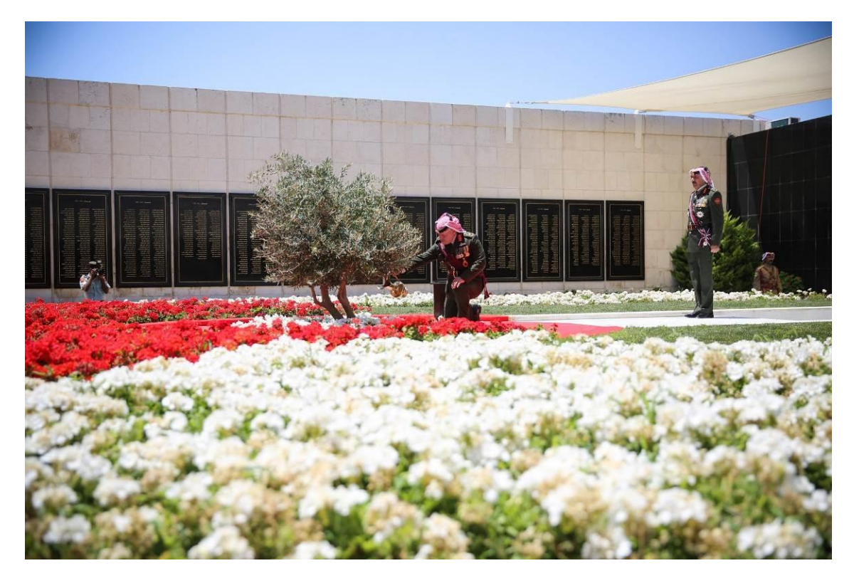
Figure 14. King Abdullah II is attending a ceremony in the Martyrs' Square and watering the sacred 'Tree of Life'