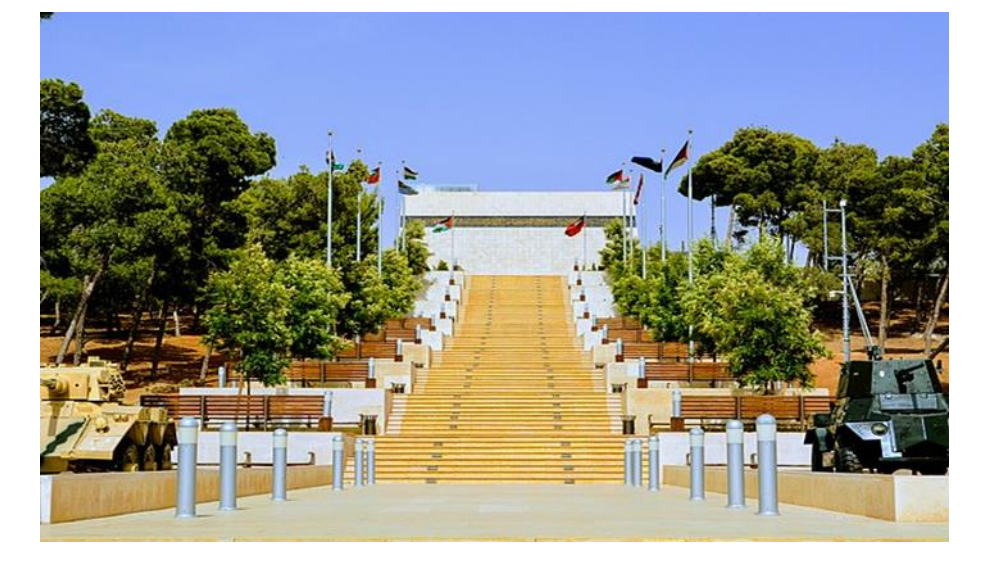
Figure 3. A view from the ceremonial entrance that shows the ascending ladder of stairs, the pine trees, and the Martyr's Memorial Museum

At the end of these stairs, the evident salience of the Martyr's Memorial is realized to the visitors by the vast front-court and the Memorial's white walls, its distinctive architecture, its immense size, and its high placement when looking to the opposite direction towards the west; where the stadium is erected. At this point, the visitors instantly appreciate the 'power' of the Memorial because they have to look at it from a low angle (see Figure 4), and they experience a sense of humbleness and respect to the huge structure (Kress and van Leeuwen 2006, 140).