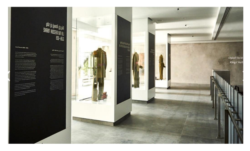
Figure 11. A view of from 'the Kings' Hall'

uniform and few possessions of one monarch. The possessions vary in their types and functions; so, we find swords, pistols, ornaments, or pairs of shoes (see Figure 11).