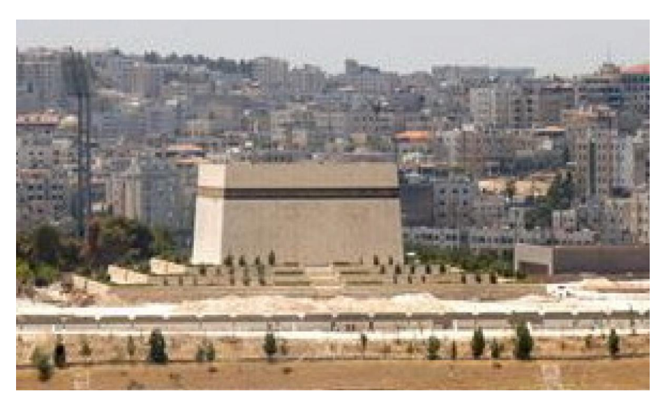
Figure 2. A distant angle-view of the Martyr's Memorial Museum and its main entrance

The Martyr's Memorial Museum stands at the top of a hill in the capital city Amman. It forms a visually distinctive landmark for the pedestrian and commuters between two vibrant roads which connect the eastern and western parts of Amman. This hill is the only elevated geographic area within the landscape of Al-Hussein's City for Sport and Youth and its adjacent park which makes the Memorial building ( Sarh 'edifice') the most salient structures in the area. Even from a distance, the Memorial building looks as a landmark in the Sport City district in Amman because of its large size, its outstanding visual and architectural structure, and its high placement at the top of the hill (see Figure 2).