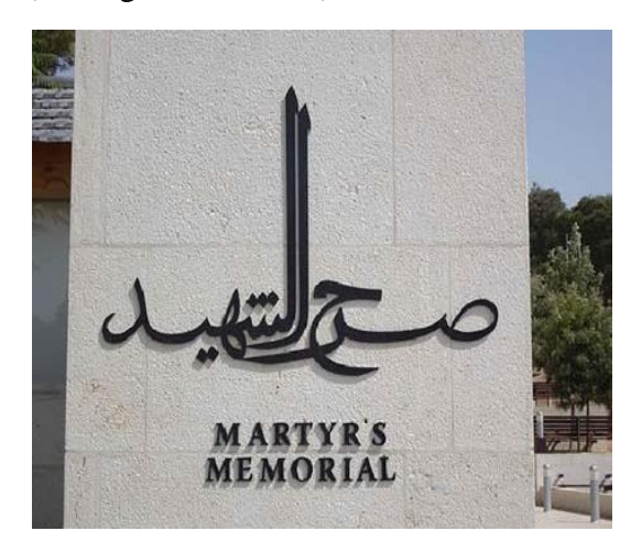
Figure 15. The logo of the Martyr's Memorial

Calligraphers in the Abbasid era. This inscription is used for grand and imposing matters as the typographic treatment in the logo shows a vanishing stroke sides; then, slowly it evolves and accumulate in the middle (see Figure 15 below).