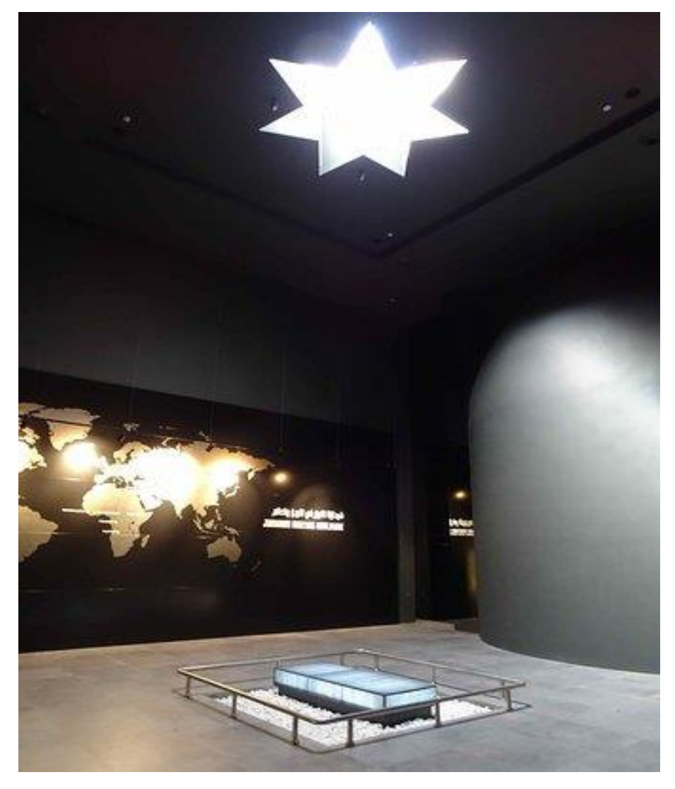
Figure 8. The Tomb of the Unknown Soldier, the seven-pointed-star skylight, and the world map that shows the countries where Jordanian martyrs fall

The space of 'the Tomb of the Unknown Soldier' involves several semiotic resources which reflect the main theme of the Memorial's spatial-texts which commemorate those Jordanian martyrs who fell in different battlefields. First of all, the 'burial chamber' is a relatively Bound space; thus, it gives the visitors additional feeling of security as a comfort zone with the necessary freedom to tour inside the chamber space. There are no restricted areas around the Tomb, and the visitors can easily stand before the Tomb or the map of the world; and thus, interact with them. Similar to the 'Land of Struggle and Sacrifice' space, the space of 'the Tomb of the Unknown Soldier' is depicted as a source of light in contrast to the dim space surrounding it. This rhythmic theme is semiotically expanded by the addition of the natural sunlight that perpendicularly falls from the roof skylight onto the Tomb. In addition, there is the seven-pointed-star skylight which stands for the Sab'a al Mathani (" Al-Fatiha Chapter; aka , the Seven repeated [verses] of the Holy Qur'an". This star is a symbolic sign that also appears on the Jordanian flag and the Coat of Arms of Jordan. This semiotic arrangement tells that