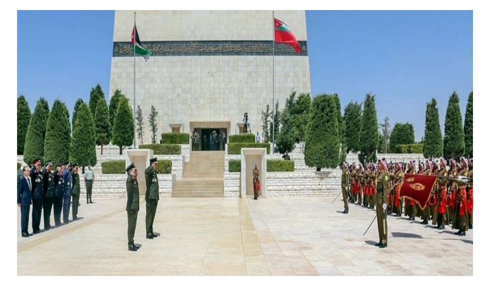
Figure 5. A military ceremony organized in the Memorial Square in front of the Martyr's Memorial and attended by King Abdullah II

The distinctive architecture of the Martyr's Memorial creates strong a frame that distinguishes it from the surrounding buildings and squares constructed decades after the inauguration of the Memorial. Through the combination of these geographic and architectural features which can be recognized as idiosyncratic semiotic resources, the Martyr's Memorial acts as the centre of the whole space of the Memorial site: it is a focal point and attracts the focus of the visitors' attention. In contrast, the other two structures (the 'Life' and 'Administration Offices' buildings) are marginalized; and thus, beyond the scope of the discourse of the Memorial's special-texts.