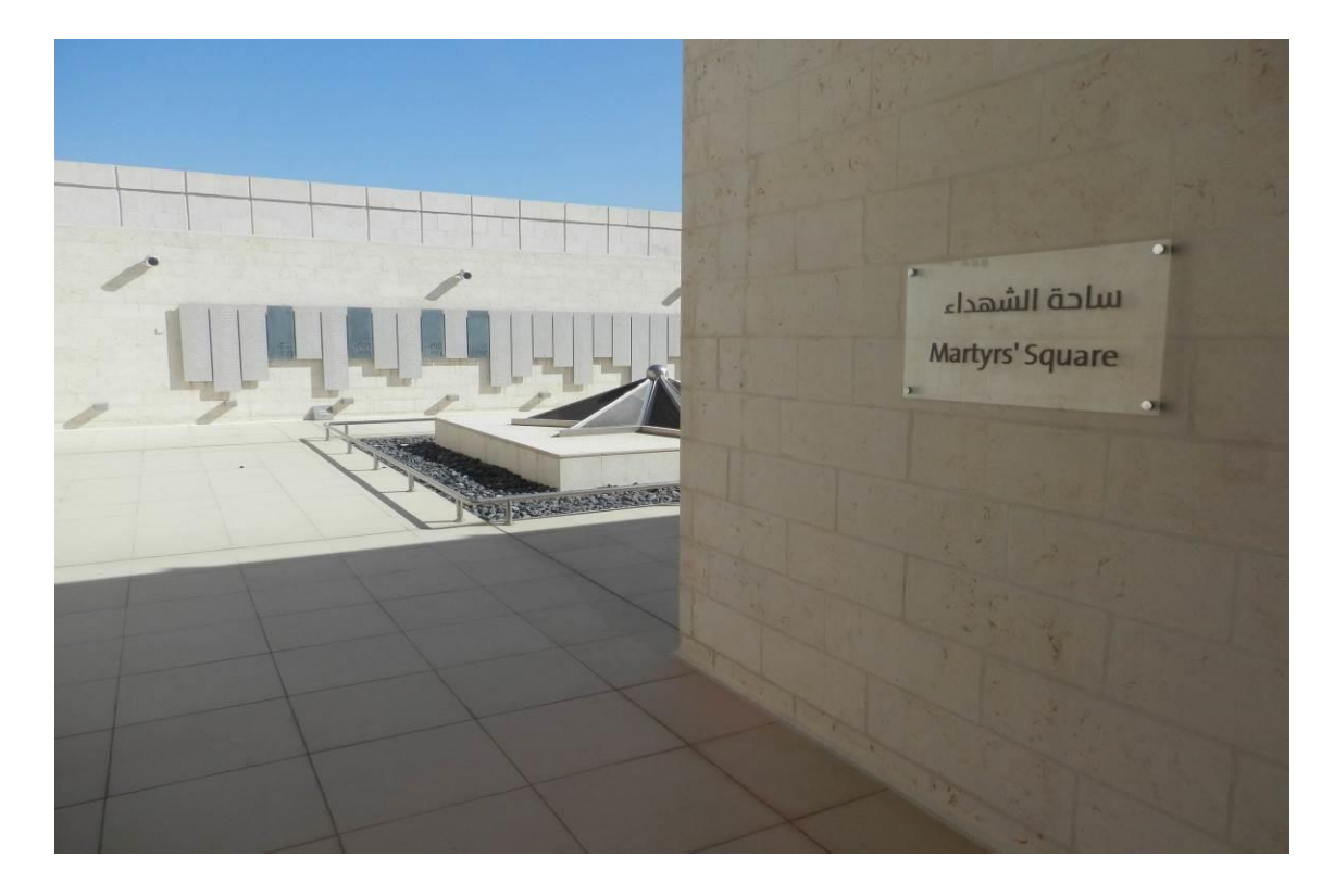
Figure 12. The 'Martyrs' Square', or the roof garden of the Museum (Note 3)

Jordan as narrated by the aforementioned spaces and exhibits in the Museum. This argument is supported by the fact that only high-profile guests and visitors can get access to the roof garden space or write their impressions about their visit to the Memorial in the Visitors' Memorial Record located in a regally-furnished office adjacent to the Kings' Hall.