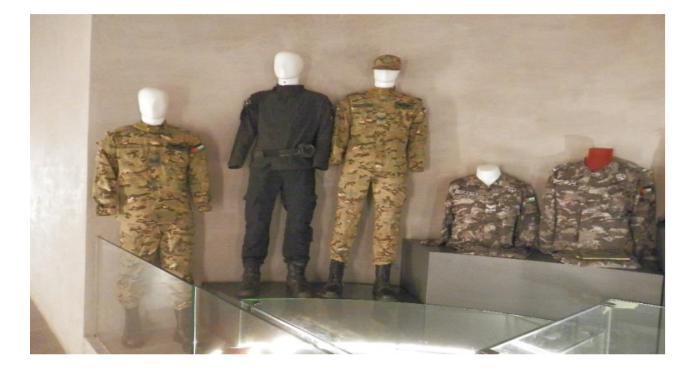
Figure 6. A partial-view of the space where military uniforms of Jordanian martyrs are displayed

The 'Land of Sacrifice and Struggle' section also narrates the life of Jordanian soldiers and martyrs by displaying different models of light weapons and equipment which have been used by Arabs and Jordanian soldiers. These exhibits are displayed inside ten transparent glass-tombs and placed directly on the floor. The ten glass-tombs are almost in the prototypical size of a tomb and are illuminated from the inside by artificial warm lights to create a contrast with the dim space of the section (see Figure 7). The exhibits are mostly old, and out of service, light weapons and equipment, such as: pistols, rifles, Arabian daggers and swords, leather bags, steel helmets, and even anti-tank mines. As a spatial-text, these exhibits are real exhibits that narrate to the visitors the life of soldiering and the course of military actions during the several events which the Jordanian soldier had experienced starting from the Great Arab Revolt in 1916 until the Arab-Israeli wars in the 1970s. Furthermore, the exhibits implicitly narrate part of modern history and the arms-race between the colonial powers of the age through the source of these weapon and equipment which are mostly British and German.