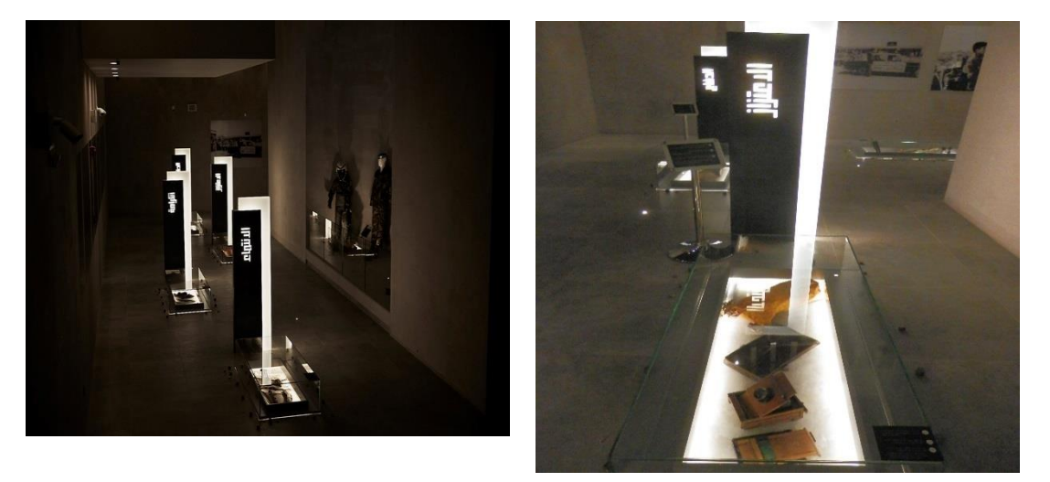
Figure 7. Illuminated glass-tombs and exhibits displayed inside them

The 'Land of Sacrifice and Struggle' section also narrates the life of Jordanian soldiers and martyrs by displaying different models of light weapons and equipment which have been used by Arabs and Jordanian soldiers. These exhibits are displayed inside ten transparent glass-tombs and placed directly on the floor. The ten glass-tombs are almost in the prototypical size of a tomb and are illuminated from the inside by artificial warm lights to create a contrast with the dim space of the section (see Figure 7). The exhibits are mostly old, and out of service, light weapons and equipment, such as: pistols, rifles, Arabian daggers and swords, leather bags, steel helmets, and even anti-tank mines. As a spatial-text, these exhibits are real exhibits that narrate to the visitors the life of soldiering and the course of military actions during the several events which the Jordanian soldier had experienced starting from the Great Arab Revolt in 1916 until the Arab-Israeli wars in the 1970s. Furthermore, the exhibits implicitly narrate part of modern history and the arms-race between the colonial powers of the age through the source of these weapon and equipment which are mostly British and German.