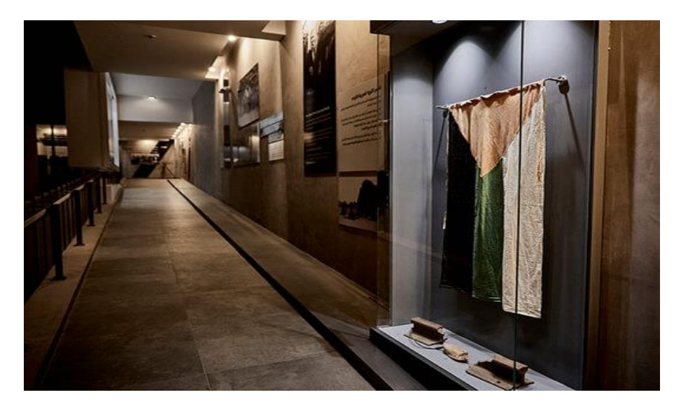
Figure 9. The beginning of the Intermediate (ramp) Level named 'Story of a Nation, Story of Humanity'

After finishing from the section of 'the Unknown Soldier Tomb', visitors pass through the same 'burial chamber' entrance and take a right-hand passage to the second level of the Museum which is named 'Story of a Nation, Story of Humanity'. This section is designed as a narrow gallery that has two walls on each side. This gallery extends along a ramp that gradually ascends around the interior walls of the Memorial until it reaches the Upper Level. This space is the longest one with the largest number of exhibits in the Museum. These exhibits mostly consist of pictures, maps, historical texts and documents, flags and banners, few artifacts and equipment, and some personal belongings of Jordanian martyrs (see Figure 9).