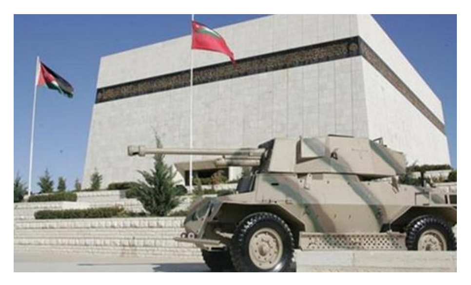
Figure 4. A low angle-view of the Martyr's Memorial Museum with a (real-size) military vehicle placed in the Memorial Square

At the end of these stairs, the evident salience of the Martyr's Memorial is realized to the visitors by the vast front-court and the Memorial's white walls, its distinctive architecture, its immense size, and its high placement when looking to the opposite direction towards the west; where the stadium is erected. At this point, the visitors instantly appreciate the 'power' of the Memorial because they have to look at it from a low angle (see Figure 4), and they experience a sense of humbleness and respect to the huge structure (Kress and van Leeuwen 2006, 140).