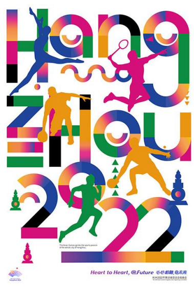
Figure 1. Share the Asian Games