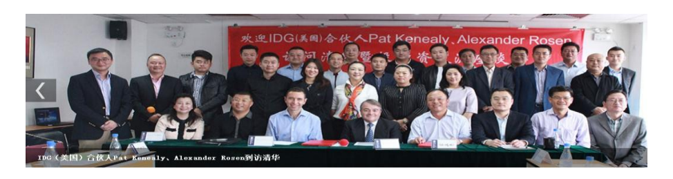
Figure 10. The Latest Photo on the Homepage of Tsinghua