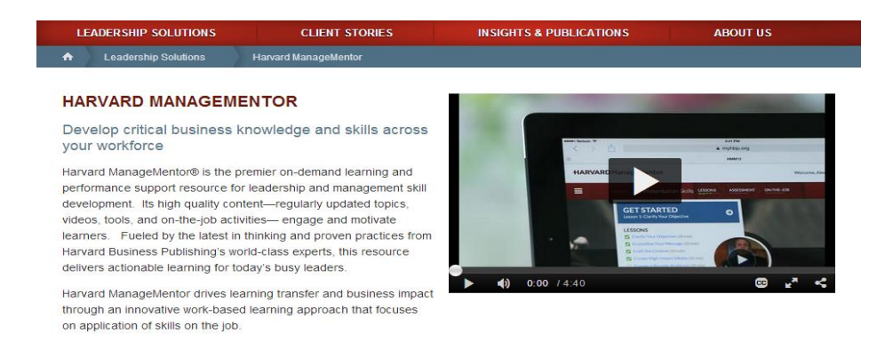
Figure 3. Primary Links in Harvard