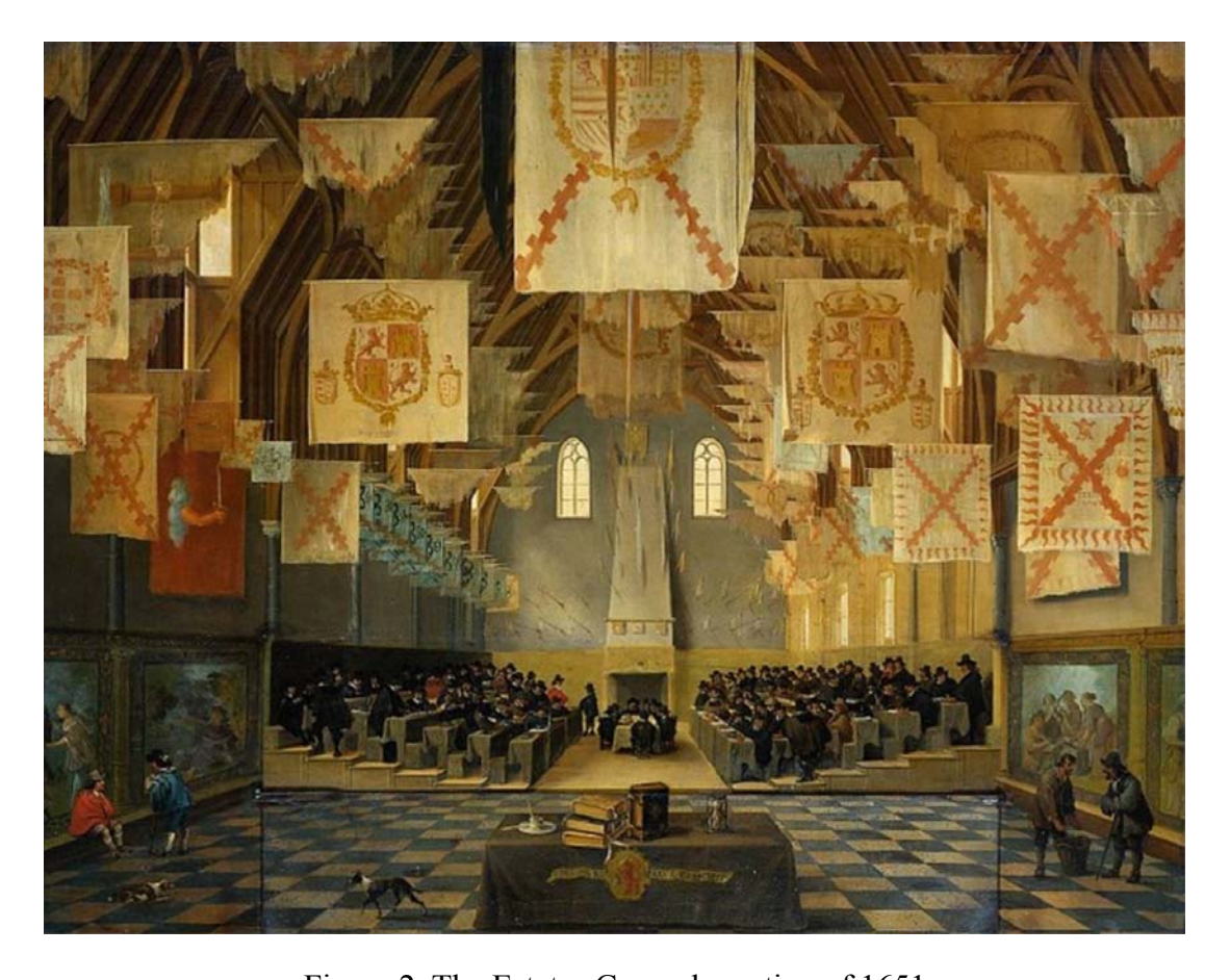
Figure 2. The Estates General meeting of 1651

However, during the 17<sup>th</sup> century the political system in the UP became more oligarchic. The number of town council members was reduced and, in practice, administrative authority was being undertaken by wealthy members and members of the aristocracy, the so called rejenten. For example, in Amsterdam the administration of the city was exercised by a group of four mayors who were not elected by the city's citizens or the stadtholder. Instead, they were elected internally, by previous mayors and a few citizens from the vroedschappen. Thus, any external check on the actions of the rejenten was very limited. We don't know, however, why the initial democratic practise of local governance was replaced by a more oligarchic political structure.