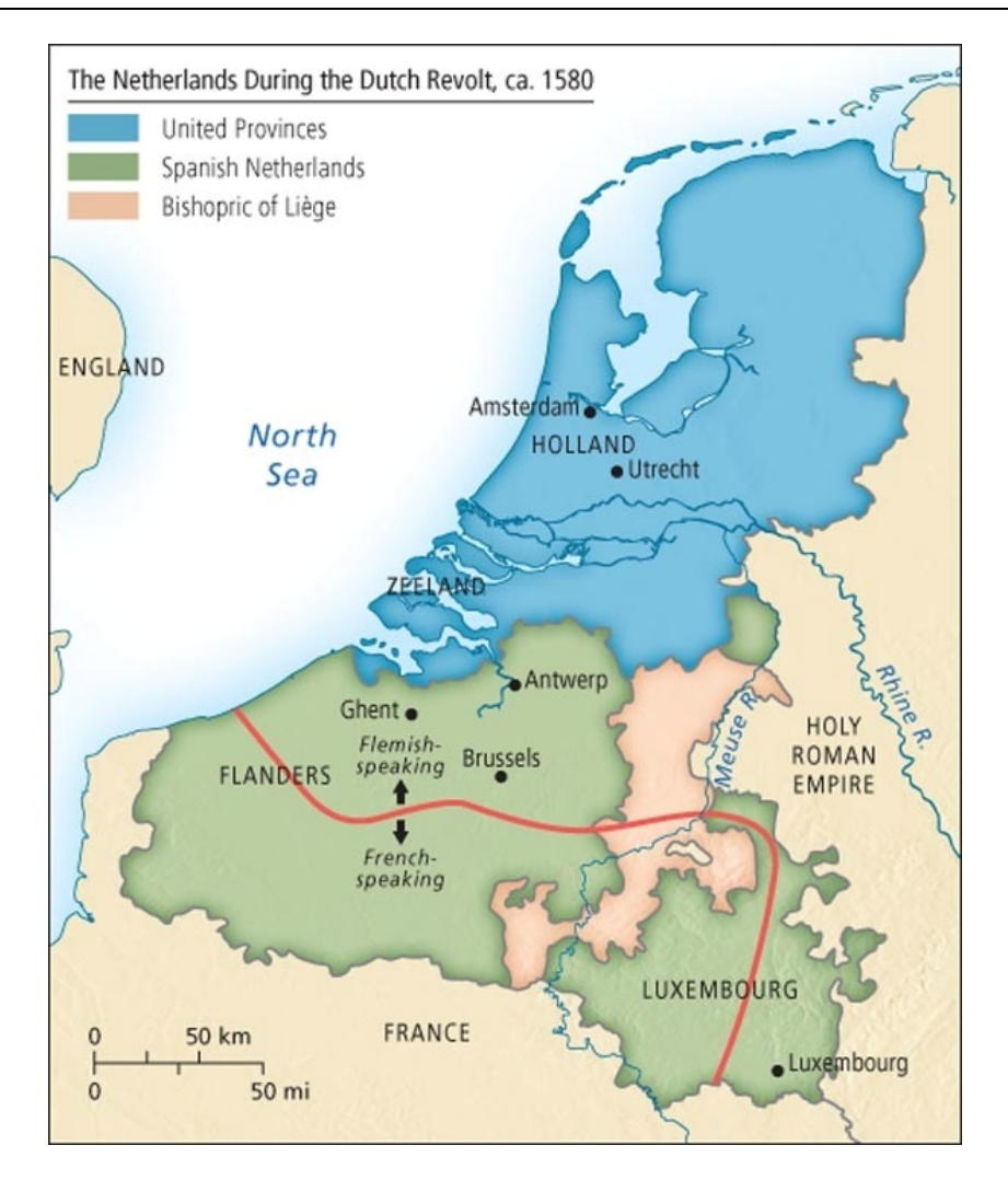
Figure 1. United Provinces territory (blue colour) during the revolt era

The main institutional body was the Estates General which met every day, even on Sundays. To these meetings every province could send a representative, who could vote on a variety of issues under discussion, such as foreign relations, alliances, war or peace strategy, federal budget, federal taxation and tariffs. Thus, the Estates General could be seen as a version of a Parliament comprised of members that were elected in a number of cities in each of the seven provinces. Holland, which was the most affluent province, was burdened with 58% of the total federal tax (Amsterdam being responsible for 27% of the 58%), while the least affluent province, Overijssel, paid only 4% of the federal tax. We are referring to "federal" mechanisms since the UP evolved into a quasi-federal entity as we will further analyse.