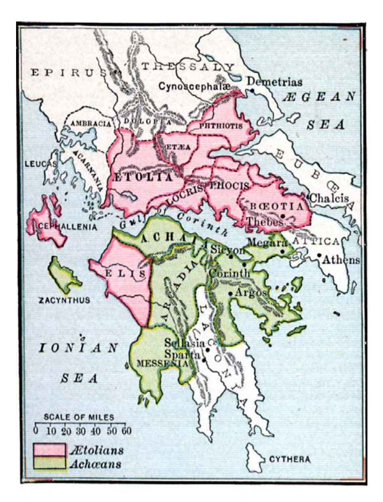
Picture 1. The Achaean (green colour) and the Aetolian state (purple colour), two neighbouring democratic federations in central/southern Greece

As with the other ancient Greek federations, the main motive for its creation was defense against the kingdom of Macedonia of northern Greece, as well as Sparta and the Aetolian federation, two neighboring states. Since each state in the region of Achaea was not capable enough to protect itself only by its own means, they found that a joint provision of the public good defence could be beneficial for all city-states. This, as we will argue proved successful.