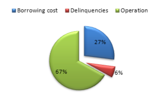
Figure 2. Cost structure of financially sustainable MFI