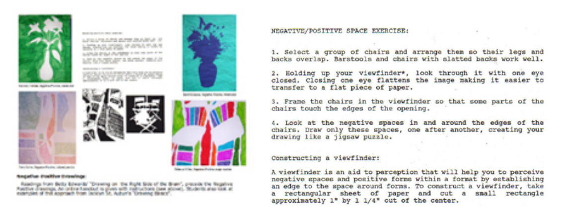
Figure 1. Negative space drawings and handout of instructions

The Value assignment included pencil shading exercises and a value drawing. Online handouts of pencil exercises, examples of value scales, and a study of the six categories of light preceded the drawings. Examples from Chaet's "The Art of Drawing" were shown to students to help them visualize these approaches. Students recreated a variety of value approaches using graphite pencils, then were instructed to create a drawing using all the values they could see. Students in the online course were very resourceful at finding useful subjects for a good value drawing (Figure 2).