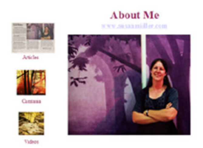
Figure 7. Screen shot of Author Miiller's "About Me" blog