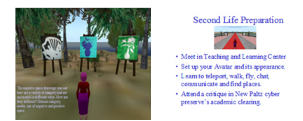
Figure 5. Screenshot of a Second Life critique using negative/ positive space drawings (left) and Second Life preparation (right)

Increasingly, online critiques are being held in Second Life. According to Semrau and Boyer, 2008, students have found the possibilities of the virtual world a rewarding method of learning and retaining what they have learned. Academic Computing maintains a presence in Second Life for students and faculty to explore the possibilities of the virtual world. To use Second Life, students must create an Avatar and an account with Linden Labs. Tutorials and a Second Life URL are embedded in the SUNY New Paltz, Academic Computing site at www.slurl.com/cyberPaltzPreserve.