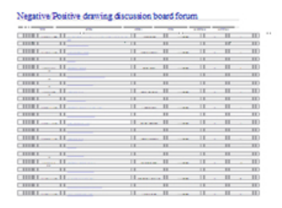
Figure 4. Discussion board forum for negative space drawing assignments

Online courses are integrating collaborative and social approaches to learning through the use of Web 2.0 tools (Alexander, 2006). Affordances to learning online include the flow and immersion of Second Life versus the "cold text" of discussion boards (Figure 4), student blogs, Camtasia, YouTube and video clips demonstrating drawing techniques. Synergy factors in student experiences play a role in online success such as Second Life (Figure 5), banners, videos, and blogs (Figures 6 and 7). Engaging learning can be afforded through the use of Web 2.0 tools that take interactivity and social presence to another level (Beldarrain, 2006).