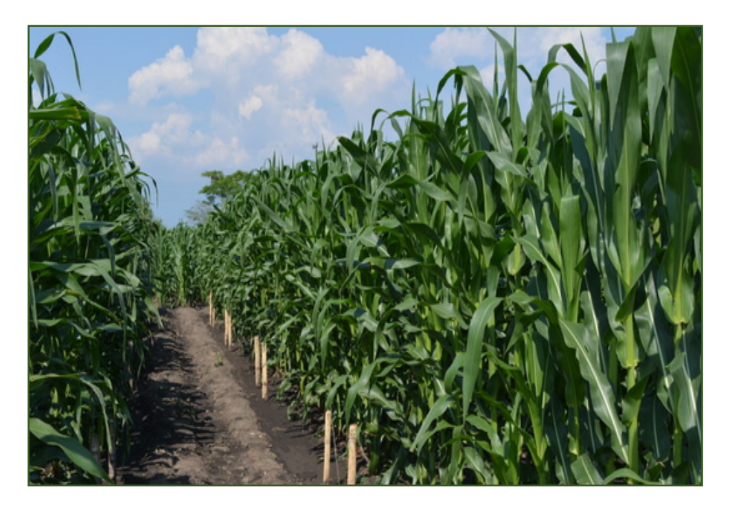
Figure 3. Zea mays culture in the experimental field

In the plot fertilized with ammonium nitrate, it was found that compared to the control variant in which it was obtained 6253 kg grains/ha, in V_1N_{50} , the favorable effect of ammonium nitrate brought an increase in production of 241 kg/ha. Maize production continued to increase with subsequent doses, reaching in the V_3N_3 variant, 6895 kg/ha, the harvest increase representing 642 kg /ha (Table 3).