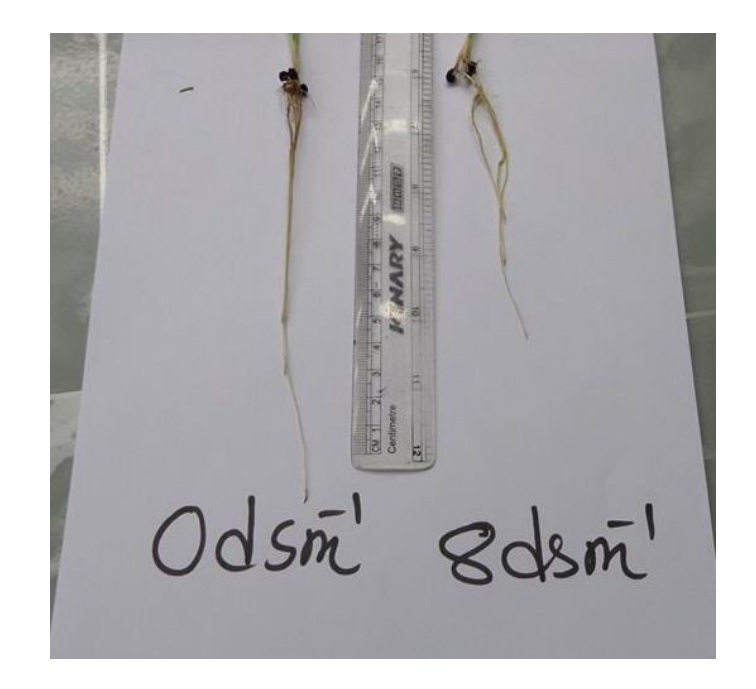
Figure 2. Effect of NaCl on root length of maize (Zea mays L.)

The effect of variety and NaCl on root length was interactively significant (p < 0.01) (Figure 2 and 3). The highest root length was observed in the treatment combination of Essence-Platinum with 0 dS m<sup>-1</sup> NaCl (512 mm) which was statistically similar to Getco seeds GP – 901 (under stress condition) and the lowest was recorded in the treatment combination of BHARAT Hybrid Sultan 702 with 8 dS m<sup>-1</sup>NaCl (201 mm).