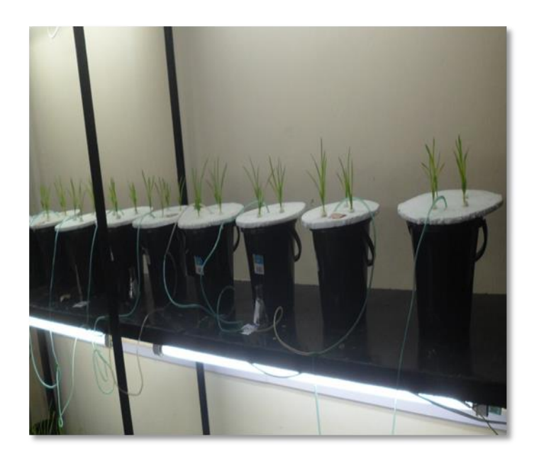
Figure 1. Preparation of black color pots with maize seedlings

The black colored pots were taken with Hogland's full strength nutrient solutions and an aeration pump was attached to supply oxygen into the water. After this, the experimental pots were laid out as per treatments and design.