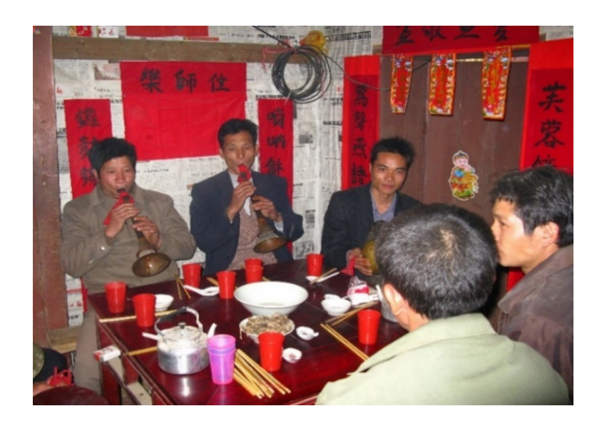
Figure 7. The musicians perform inside the house

The seating performance is held during the formal wedding ceremony and banquets. The suona players sit around a square table arranged by the host for playing, eading the progress of the wedding ceremony.