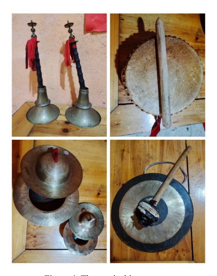
Figure 4. The musical instruments

The suona was introduced into the Yao area from the Central Plains with the migration of the Yao in the late Qing Dynasty and was widely used. Among the Jinxiu Yao, there is only one ensemble that can play wedding music, as few people can play the suona. In 2021, the researcher interviewed an ensemble that played frequently in Panyao, Fenzhan Village, and Jinxiu County. The ensemble is composed of two suonas, one small drum, one small cymbal, one big cymbal, and one gong. The music played by the two violins is the soul of the ensemble. The drum is responsible for coordinating the tempo. The drum, small cymbals, big cymbals, and gongs are percussion instruments and are played intermittently throughout the wedding.