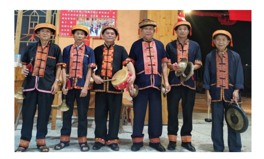
Figure 5. The musicians of the suona ensemble