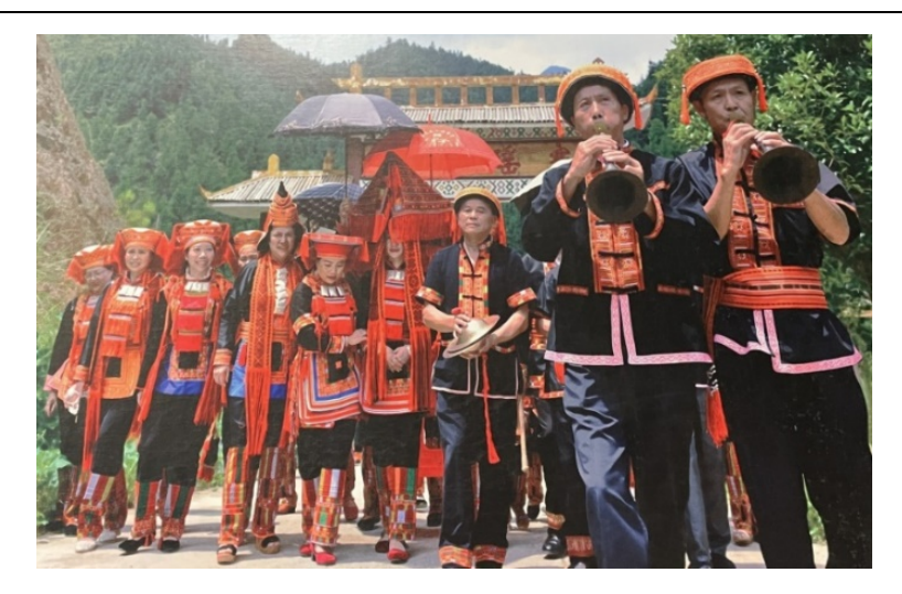
Figure 6. The Musicians perform at the village ceremony procession