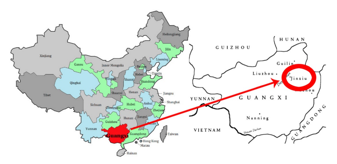
Figure 1. Map of Jinxiu, Guangxi Zhuang Autonomous Region, China

branches of Yao. Located in the DaYao Mountain Area in the east of Central Guangxi, it is the county with the most Yao branches in China. It can be divided into five branches: Pan Yao, Cha Shan Yao, Hua Lan Yao, Shan Zi Yao, and Ao Yao (Fei, 1992). Jin Xiu Yao has its own language, but there is no common use of its own national characters. Their cultural symbols are lack of written records, which are usually reflected in traditional national art or festival sacrifice. Due to the differences between traditional art and modern aesthetics, the intangible cultural heritage of Yao nationality in Jin Xiu has been severely impacted, and some traditional folk arts are on the verge of extinction. The complexity of handicrafts requires the time and human resources of craftsmen. High cost and small consumer market make it difficult for Jin Xiu Yao cultural resources to be widely spread (Zhu & Yu, 2019).