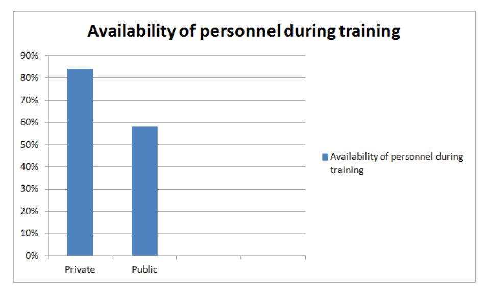
Figure 2. Availability of Personne

in Kenya is by public universities. This could be the reason why there is under-representation of Kenyan university students at the international event.