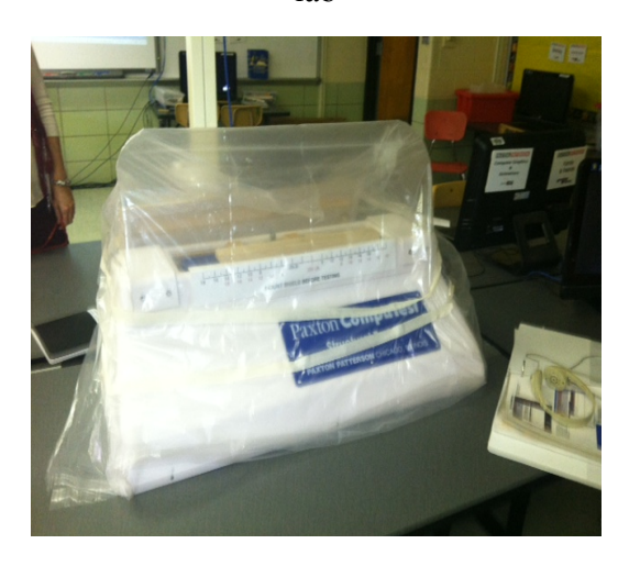
Photo 6: Paxton/Patterson project based learning lab – digital scale