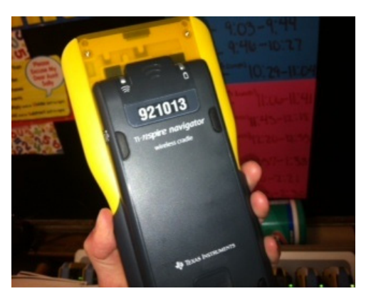
Photo 6: Texas Instruments Navigator Calculators – Wirelessly networking students' calculators to teacher computers