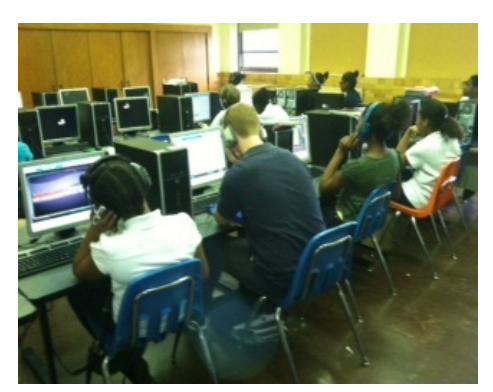
Photo 4: Computer Lab – designated for Compass Learning - differentiated learning through diversified curriculum & assessments