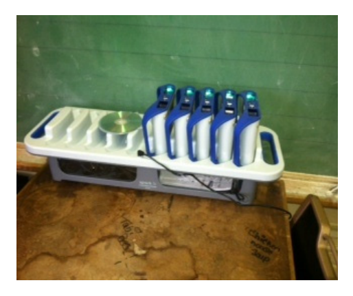
Photo 5: SPARKvue Science Learning Center - Real time data collection and graphing software