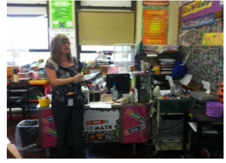
Photo 1: Mathematics instructor using Airliner technology to wirelessly interact with SMART board, while saving notes and data to hard drive.