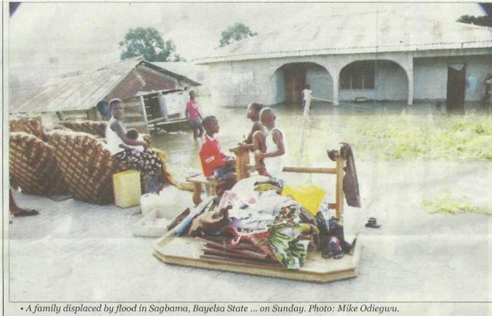
• A family displaced by flood in Sagbama, Bayelsa State ... on Sunday.