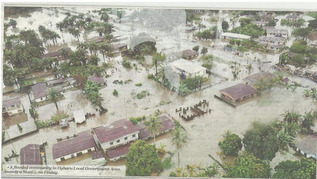
• A flooded community in Ogbaru Local Government Area, Anambra State ... on Friday.