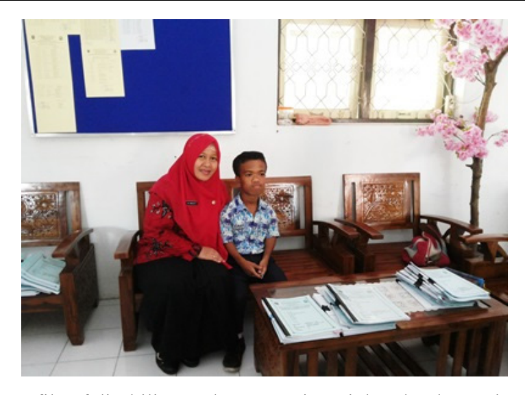
The Profile of disability student at Junior High School 4 Mojosongo

The evaluation implementation of inclusive education for disability children at Junior High School level in Central Java Province is able to be done through evaluation of educational management. Base on Regulation of Minister of National Education Number 70 in 2009 the function management of inclusive education include: planning, organizing, directing, coordination, controlling and evaluation. The school management of inclusive education coordinator gives full authority to school party to plans, coordinate, direct, control and evaluate components of inclusive education relates it. This component includes: students management, curriculum management, learning management, assessment management, teacher management, staff management, facility and infrastructure managements, administration and human resource managements.