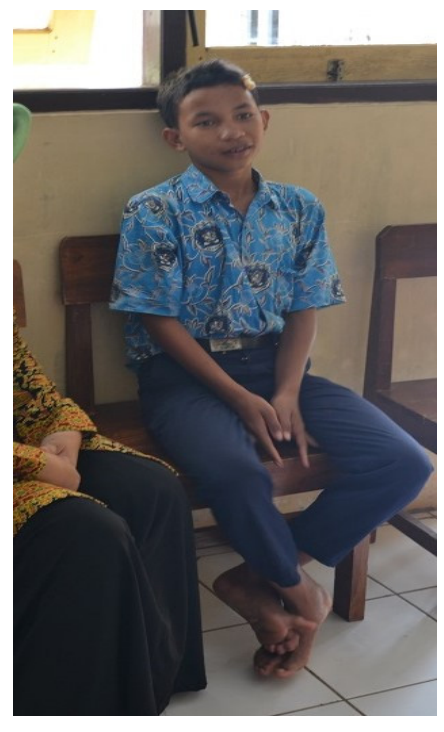
The Profile of disability student at Junior High School 1 Pageruyung

Here is a lot of profile of disability students at many Junior High Schools explained above: