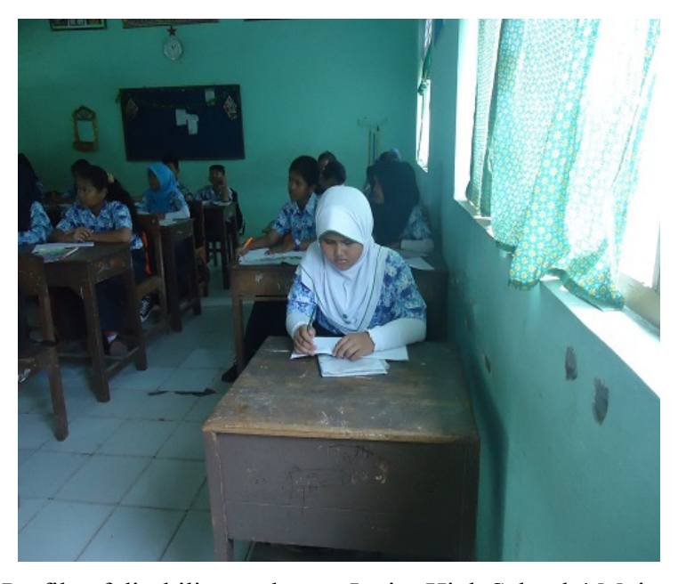
The Profile of disability student at Junior High School 4 Mojosongo