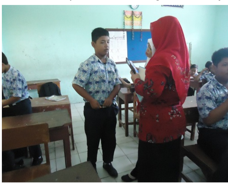
The Profile of disability student at Junior High School 4 Mojosongo