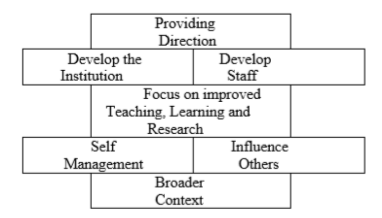
Figure 2. A framework depicting the domains of management in a university college

The most important domains of management in a university college set up are shown in figure 2. The conceptual framework was developed based on the literature of management in higher education (Drysdale & Gurr, 2017). The design was mainly to ensure the widest coverage in literature review. The seven fundamental domains framework were used to explore the knowledge base about university college management (Drysdale & Gurr, 2017). The said domains included an understanding the context, that is: providing direction; develop the institution; develop staff; focus on improved teaching, learning, and research; self management; influence others; and the broader context. These domains are key components that are most likely to sustain a university college to succeed in uncertain times. As key components, they need to be reviewed and possibly re-shaped with time. The framework itself provides important explanations of the main ideas on management that have been explored and developed in literature (Drysdale & Gurr, 2017).