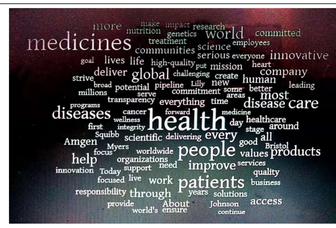
Figure 2. Word cloud map of 8 foreign pharmaceutical company profiles

By collecting the profiles of 8 (Note 1) Chinese and foreign pharmaceutical company profiles respectively (see Appendix I and II), the corresponding word cloud maps were created (see the above Figure 1 and Figure 2). From the above figures, we can see that the word "health" is given the first priority and appears most frequently in foreign pharmaceutical companies' profiles, followed by "medicine", "people", "patients", "disease", and "care". In addition, these frequent words are nouns. This shows that they focus more on the concern of people's health. However, the most frequent words in the Chinese company profiles are "研发 ( yanfa )", "创新 ( chuangxin )", "医药 ( yiyao )", "产品 ( chanpin )". This shows that the company focuses on the R&D aspect and tries to show its strength. In Chinese, verbs, such as "研发 ( yanfa )", "创新 ( chuangxin )" and "制药 ( zhiyao )" are more common.