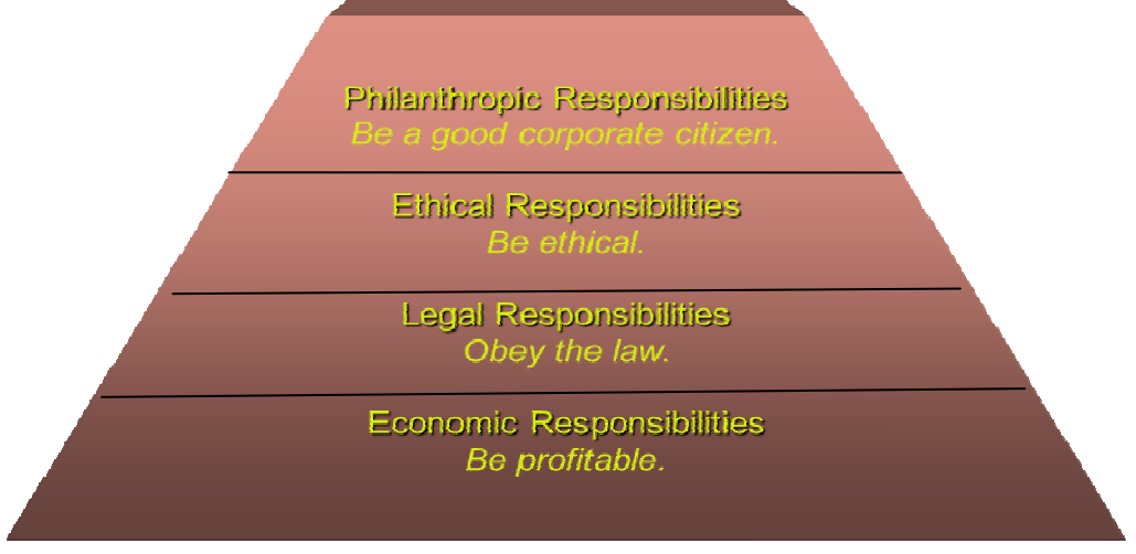
Figure 1. Carroll's Pyramid of CSR